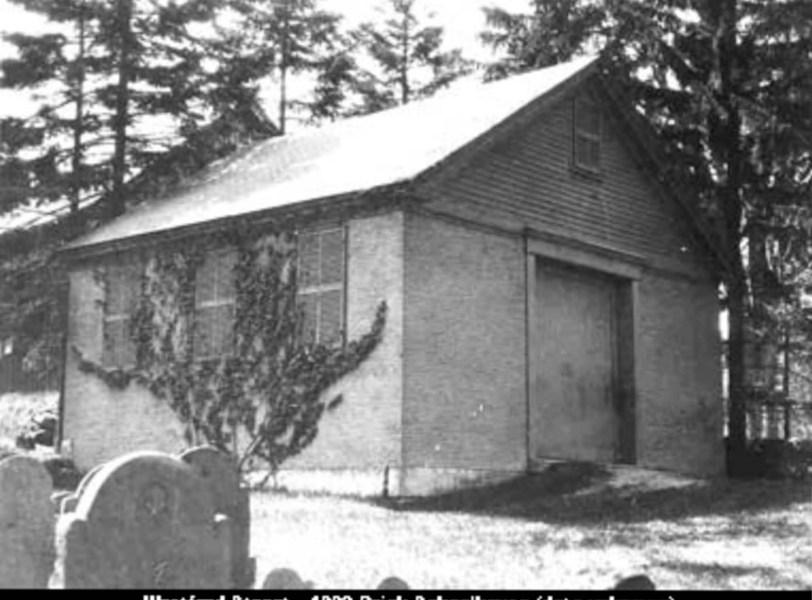
Westford Street - 1802 Brick Schoolhouse (date unknown)