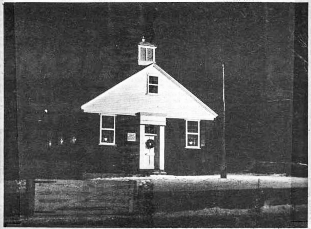
1802 SCHOOL HOUSE