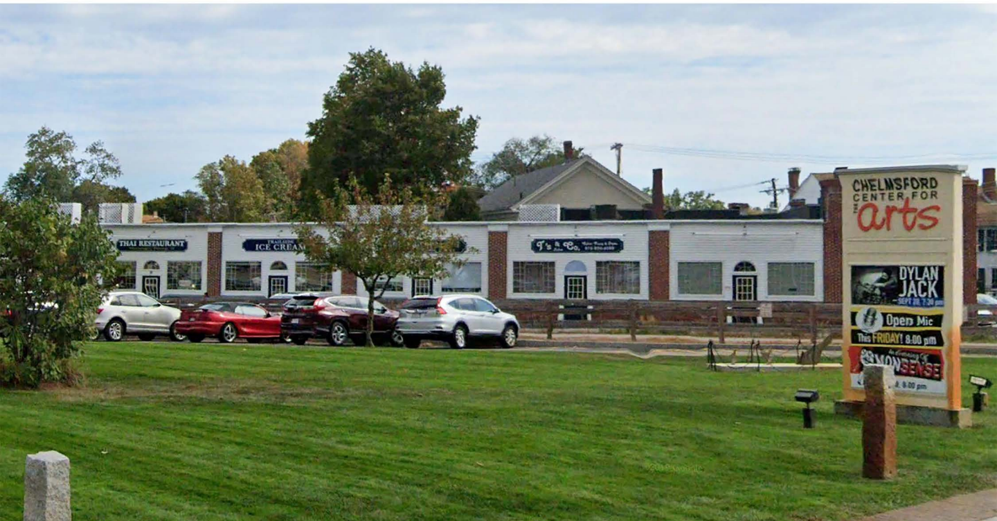
Center for the Arts front lawn and Kidder/Kalos building in 2021 on Google Earth