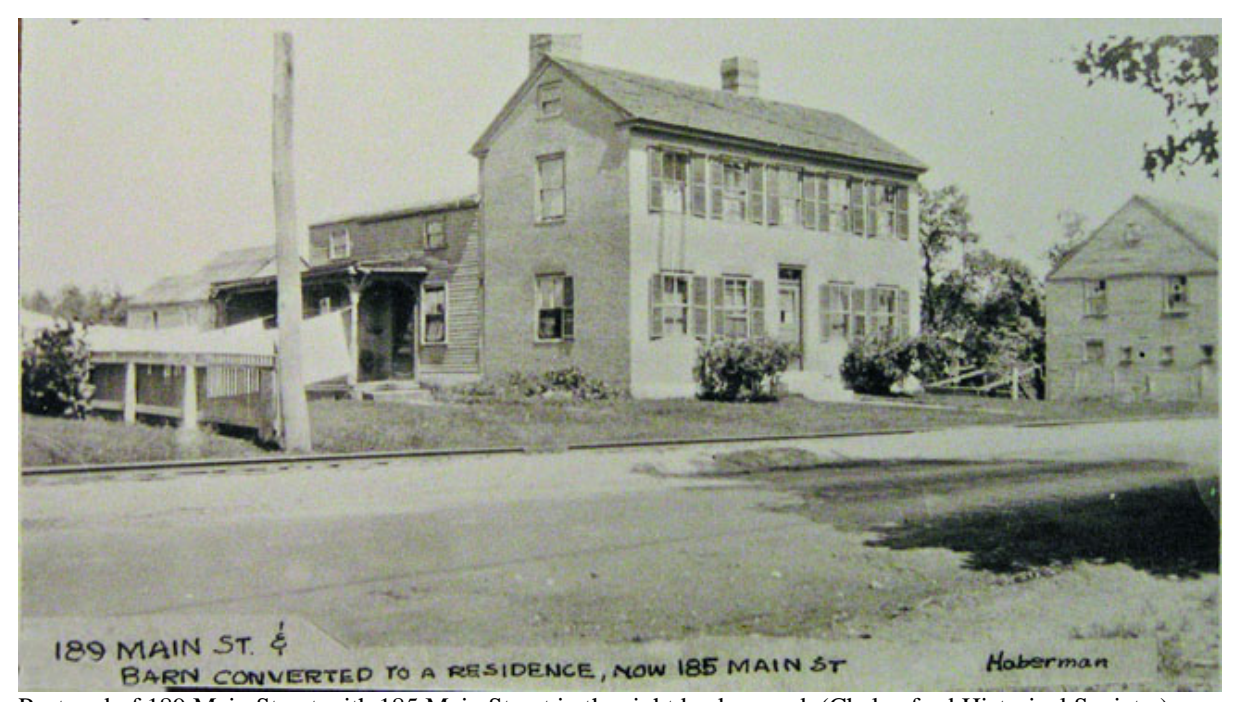
Postcard of 189 Main Street with 185 Main Street in the right background.

Middlesex North Registry of Deeds. www.lowelldeeds.com.