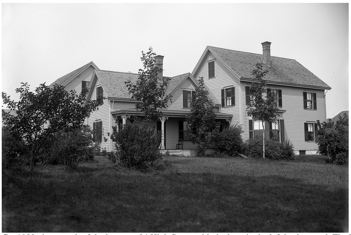
Ca. 1900 photograph of the house at 84 High Street with the barn in the left background. The barn was moved to 90 High Street ca. 1918.

Geo. H. Walker & Co., Atlas of Middlesex County, Massachusetts. Geo. H. Walker & Co., Boston, MA. 1889.