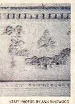
elow, Gary Hammond, own-