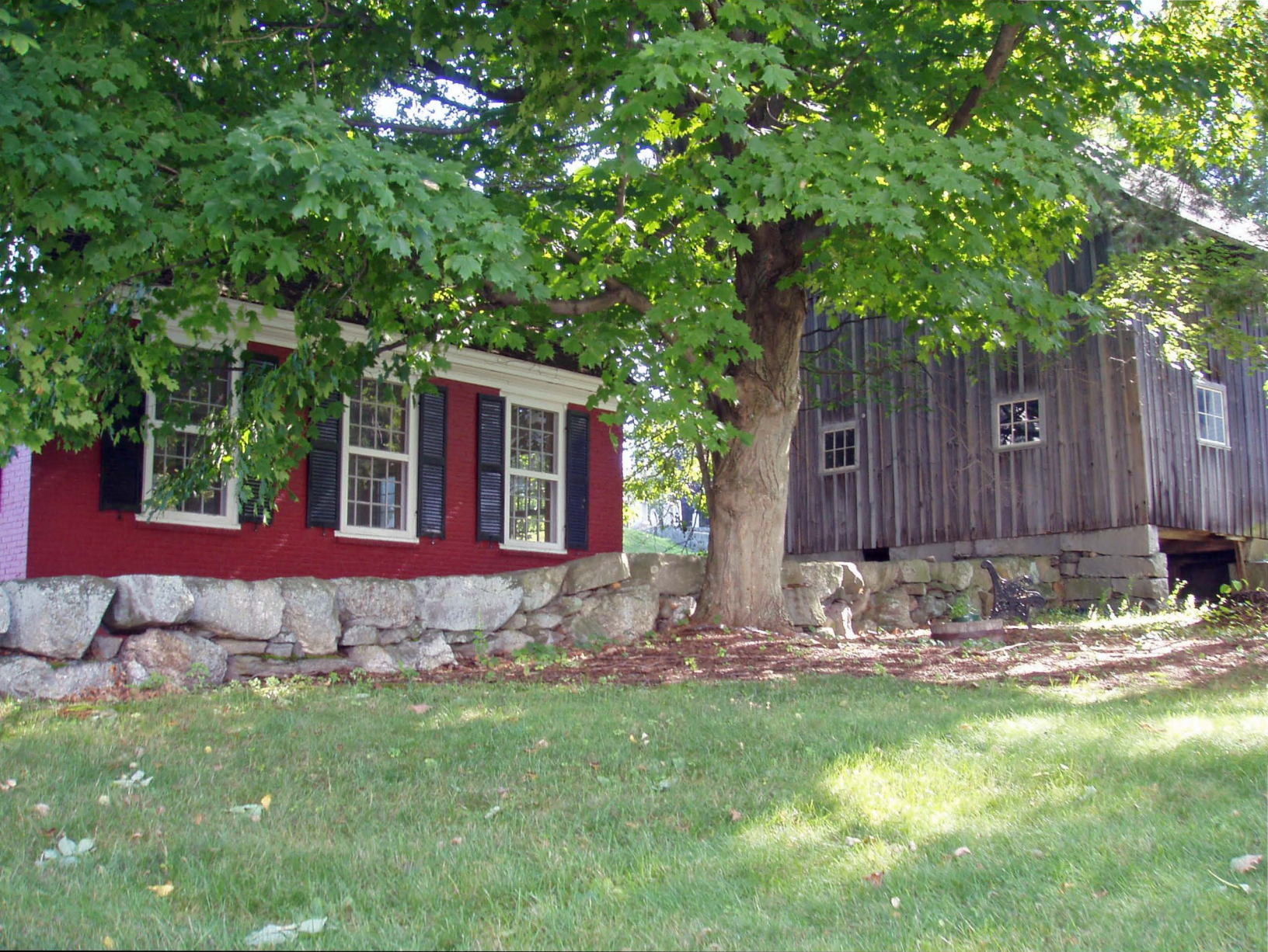
4 Westford Street - barn on right