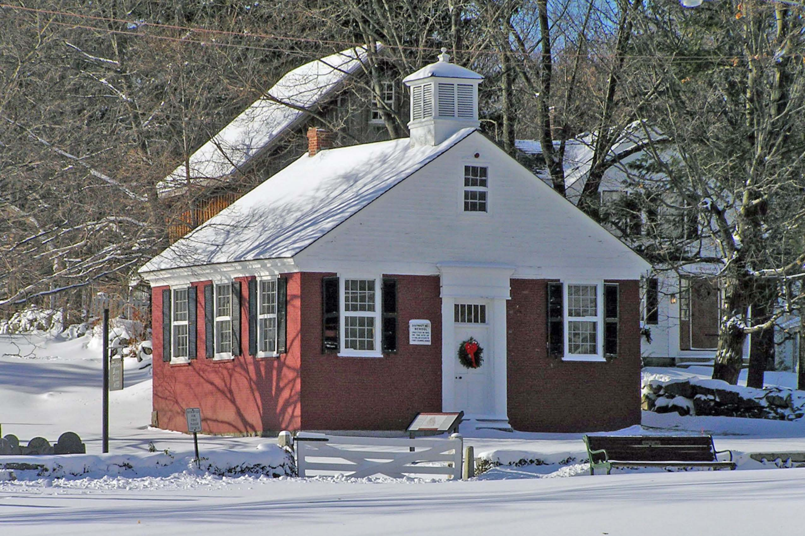
4 Westford Street in rear