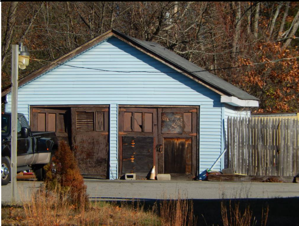
Garage, facing northeast. November 2015.