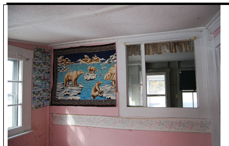
View looking north from southwest room toward main room. Note sliding window between the rooms.