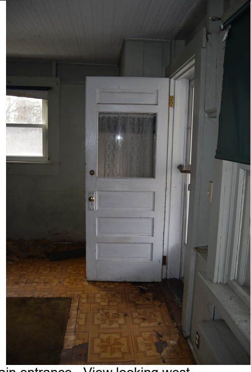
Detail. Main entrance. View looking west.