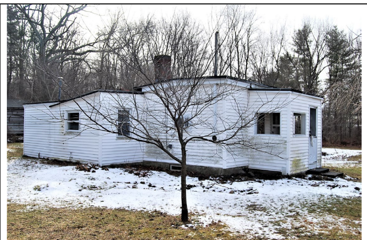
View looking southwest. From right to left: porch, main room, kitchen (with shed roof), and bathroom ell.