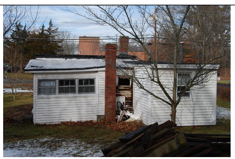
View looking north. Bedroom at left, bathroom at right.