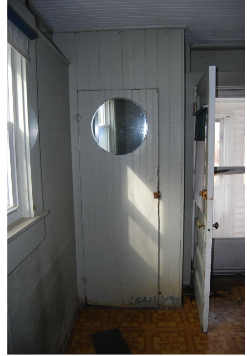
View looking north toward closet on north wall. Entrance visible at right.