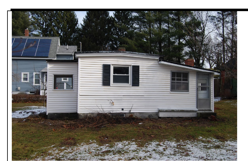
View looking east.