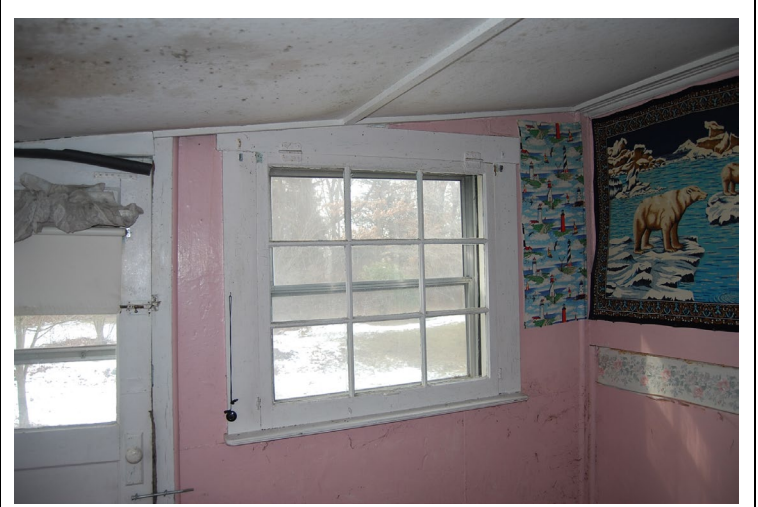
View looking northwest from southwest room toward west elevation. Note 6-light hopper window.