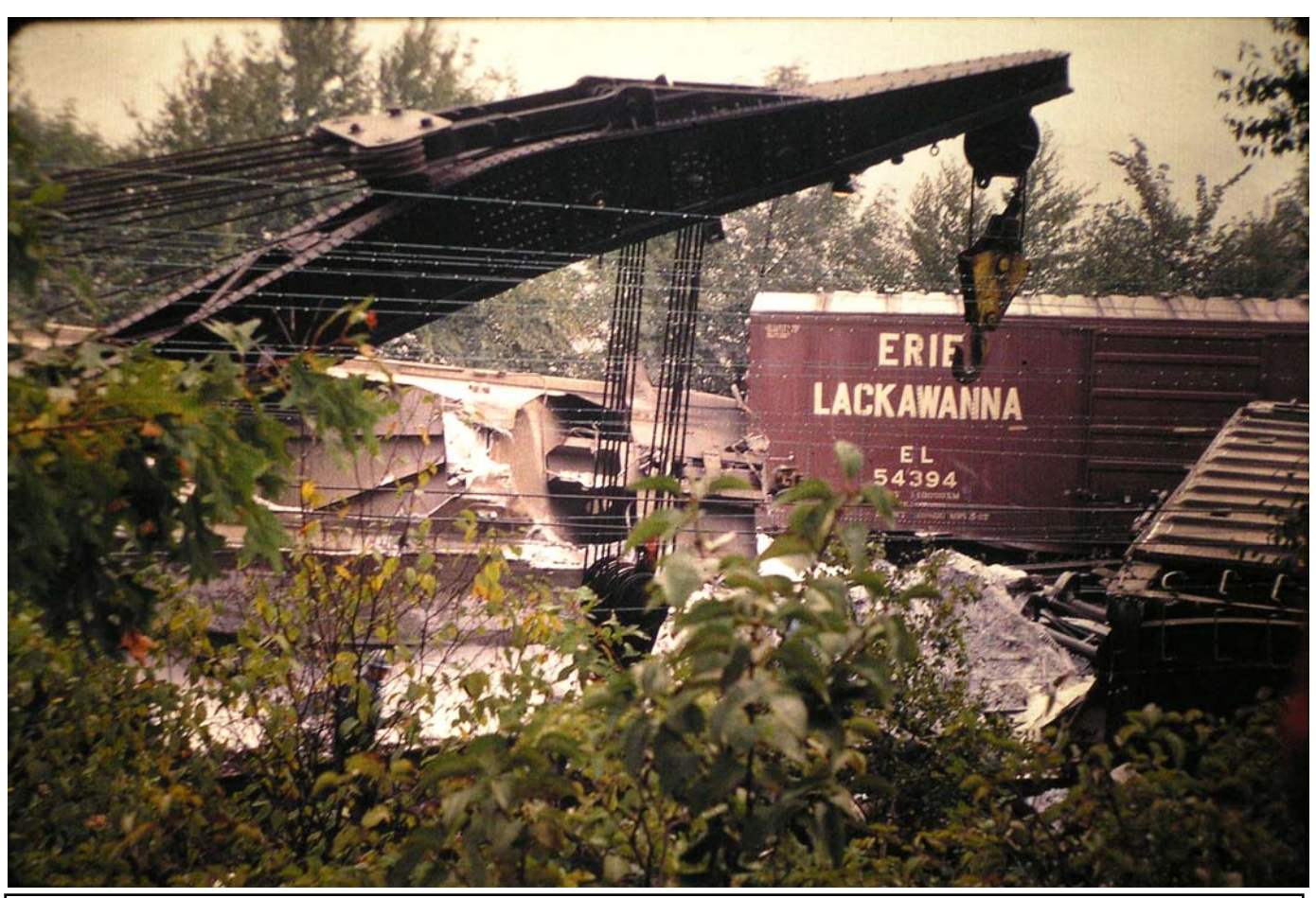
Wreck site behind Riverside Cemetery and present Maaco Auto Body Shop on Middlesex Street 9/24/1969 John A Goodwin