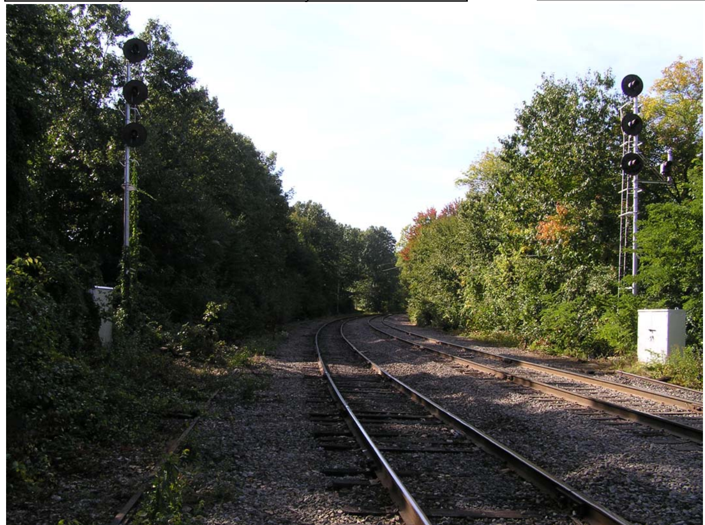
9/24/2004 F Merriam