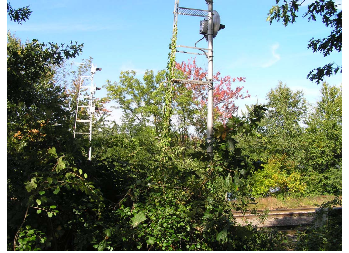
Wreck site today behind Maaco Auto Body on Middlesex Street