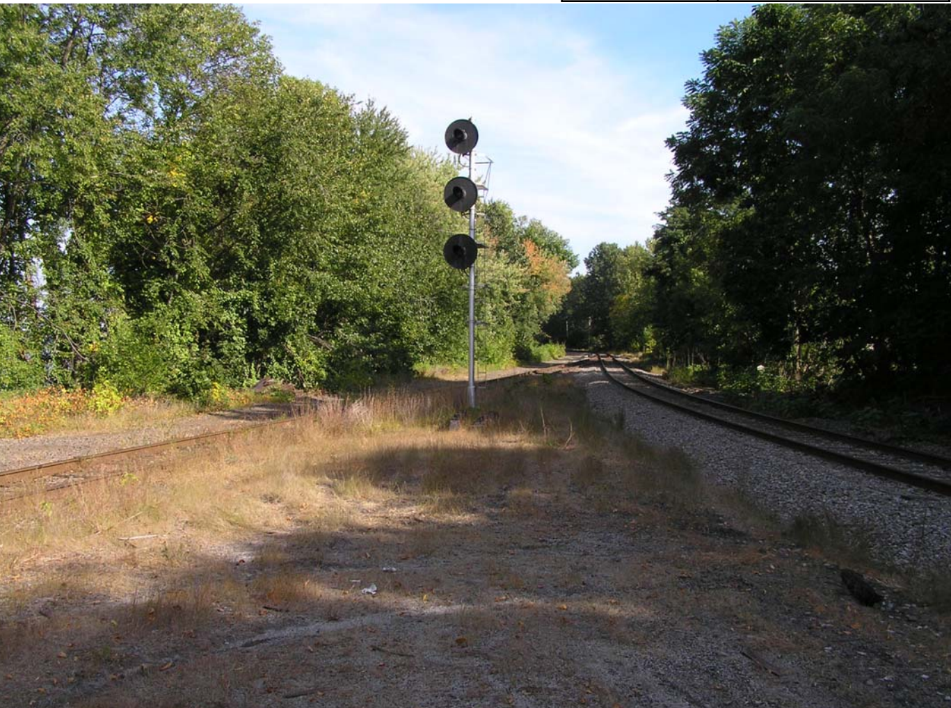
Same site today 9/24/2004

North Chelmsford Depot, switch control tower, Proctor lumber mill