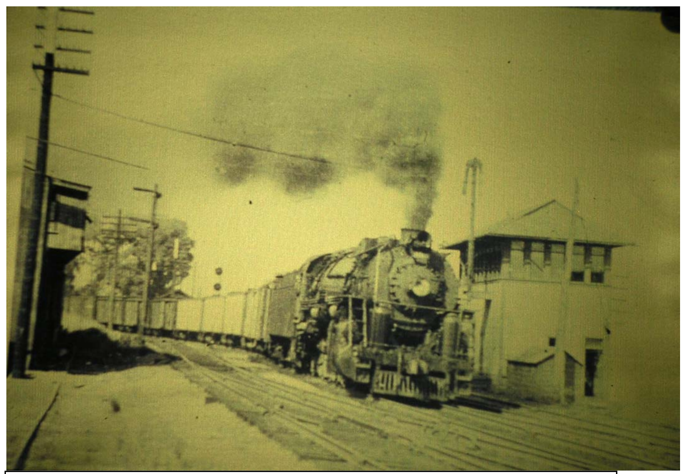
North Chelmsford control tower and Depot (behind train) - courtesy of John A Goodwin Same view today 9/25/2004 F Merriam