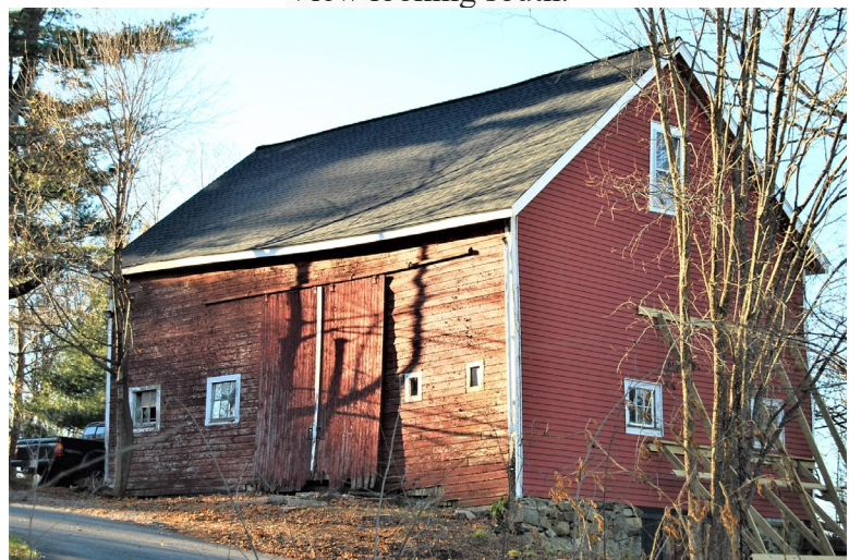
Barn. View looking northwest at southeast and northeast elevations.