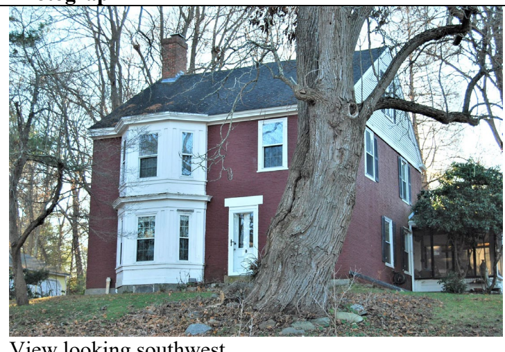
View looking southwest.