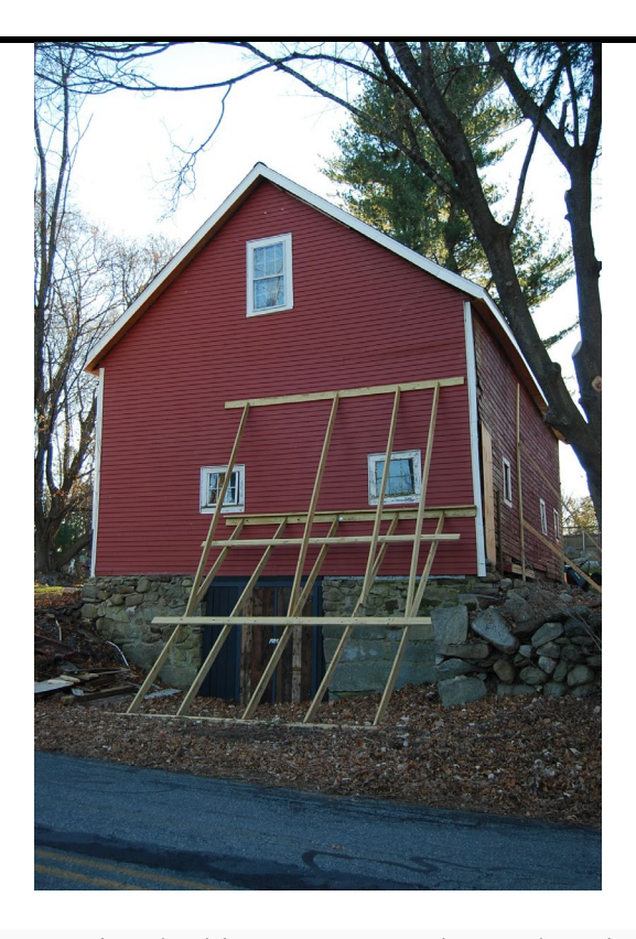
Barn. View looking west at northeast elevation.