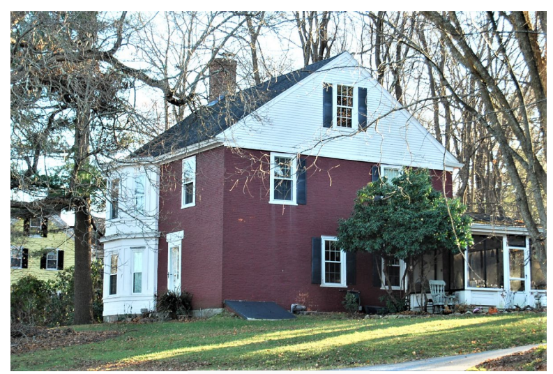
View looking south.