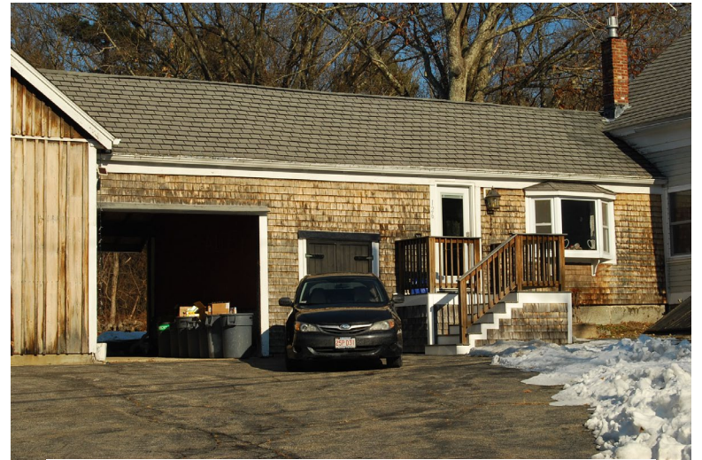
Shed/garage. View looking north from Proctor Road.