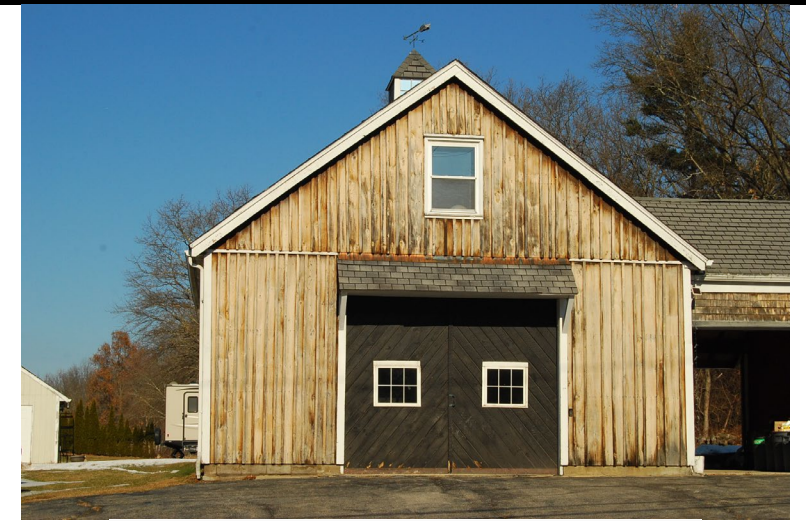
Barn. View looking north from Proctor Road.