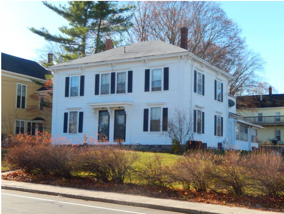
25-27 Princeton Street, facing south. November 2015.