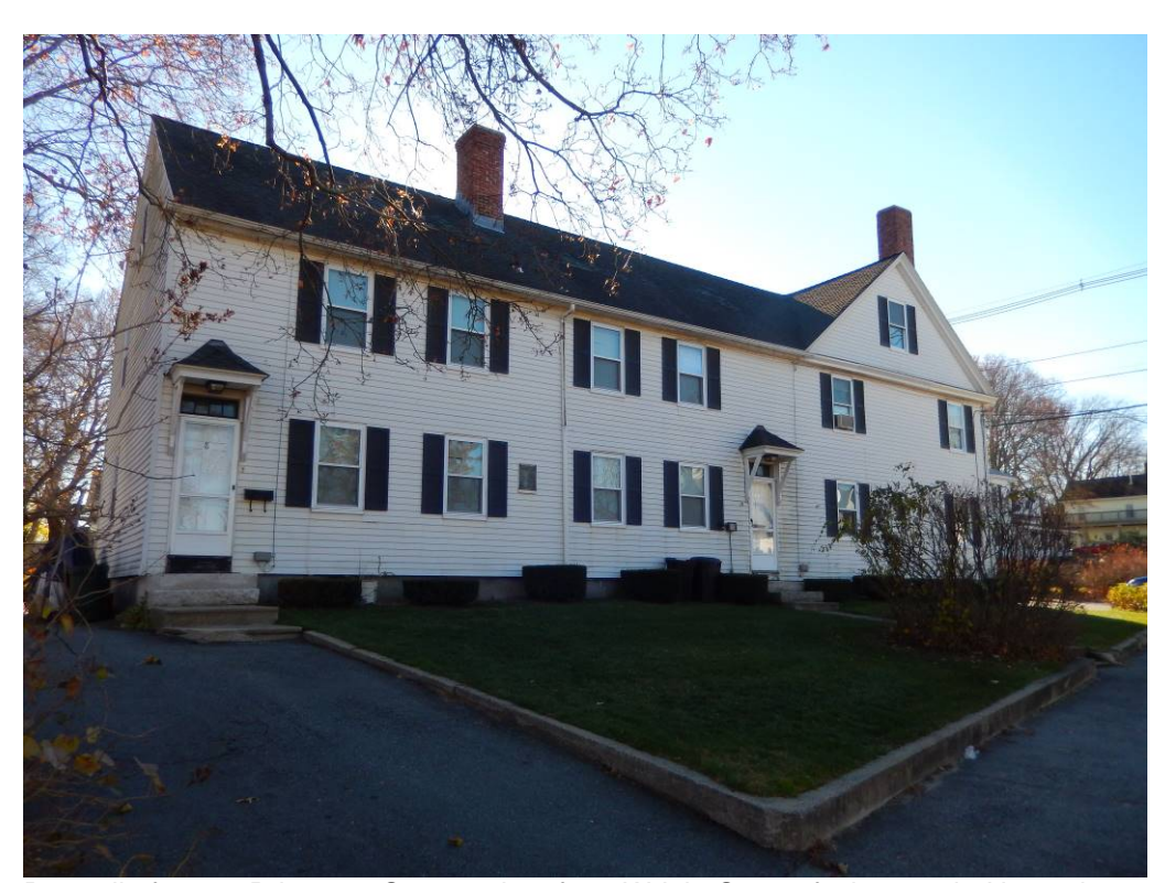
Rear ell of 22-28 Princeton Street, taken from Wright Street, facing south. November 2015.