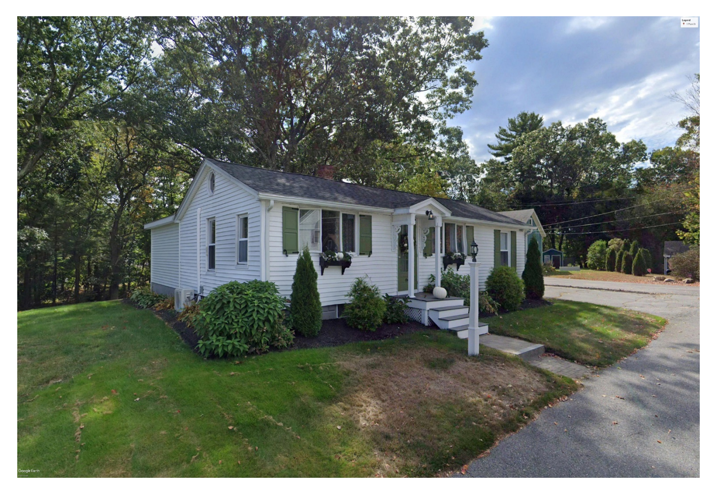
1 Plum Street, 5 March 2021, both by Fred Merriam