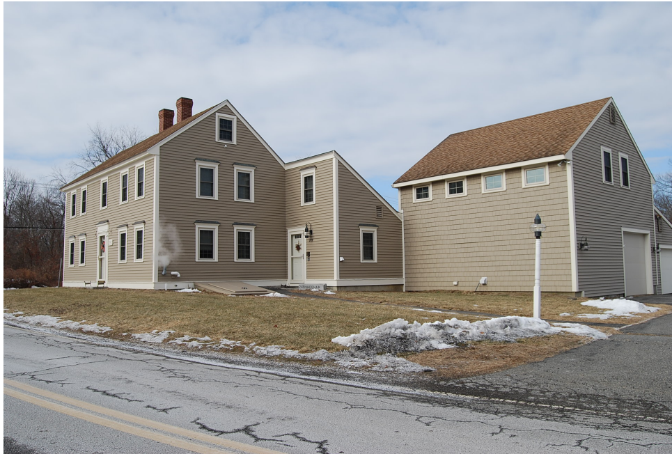
View looking west.