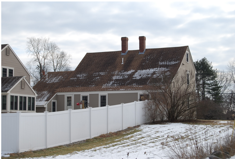
View looking south.