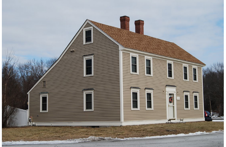
View looking northeast from intersection of Pine Hill Road and Galloway Road.