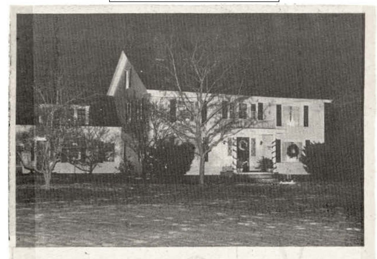
CUNNINGHAM home at 16 Parkhurst Road