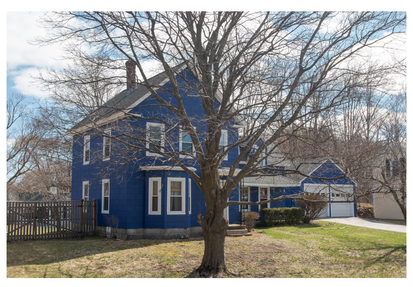
47 North Road, 2 April 2021, by Fred Merriam