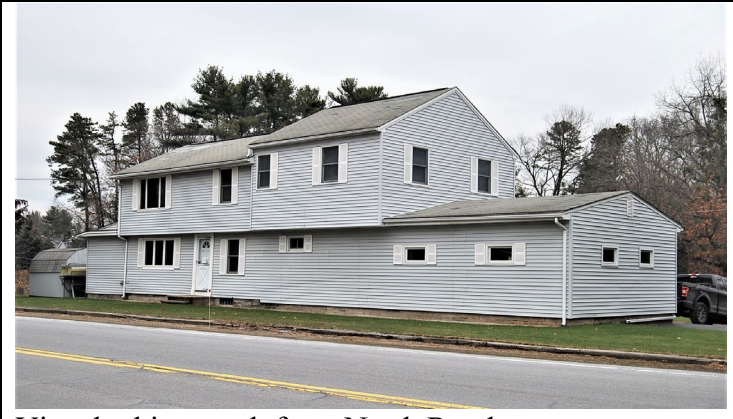
View looking north from North Road.