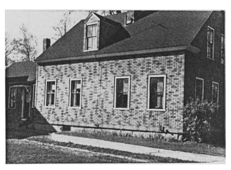
newest picture before 1969