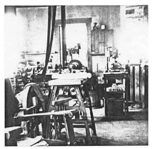
Inside of Garage