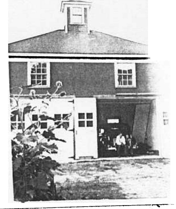
Edward + Nelson Aug. 24 Garage white inside with cardinal red Trimmings-the floor will be maroon