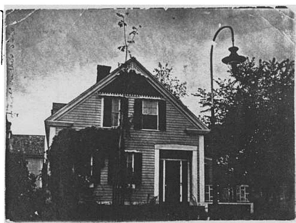
1936 oldest picTure