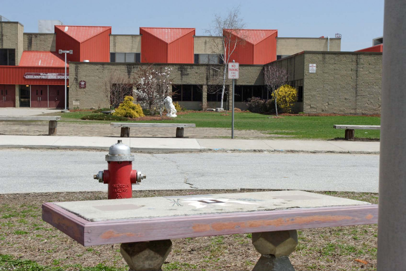
200 Richardson Road - 9 1 1 Memorial Bench