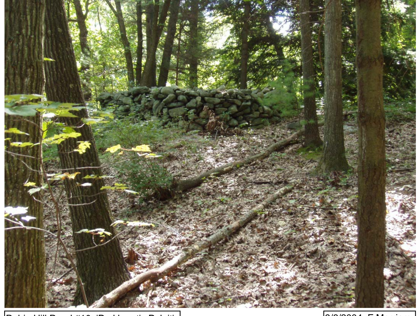
Robin Hill Road #10 'Parkhurst's Pulpit'