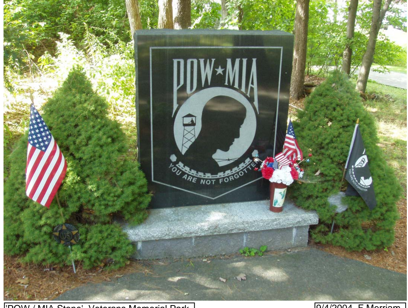
'POW / MIA Stone' Veterans Memorial Park