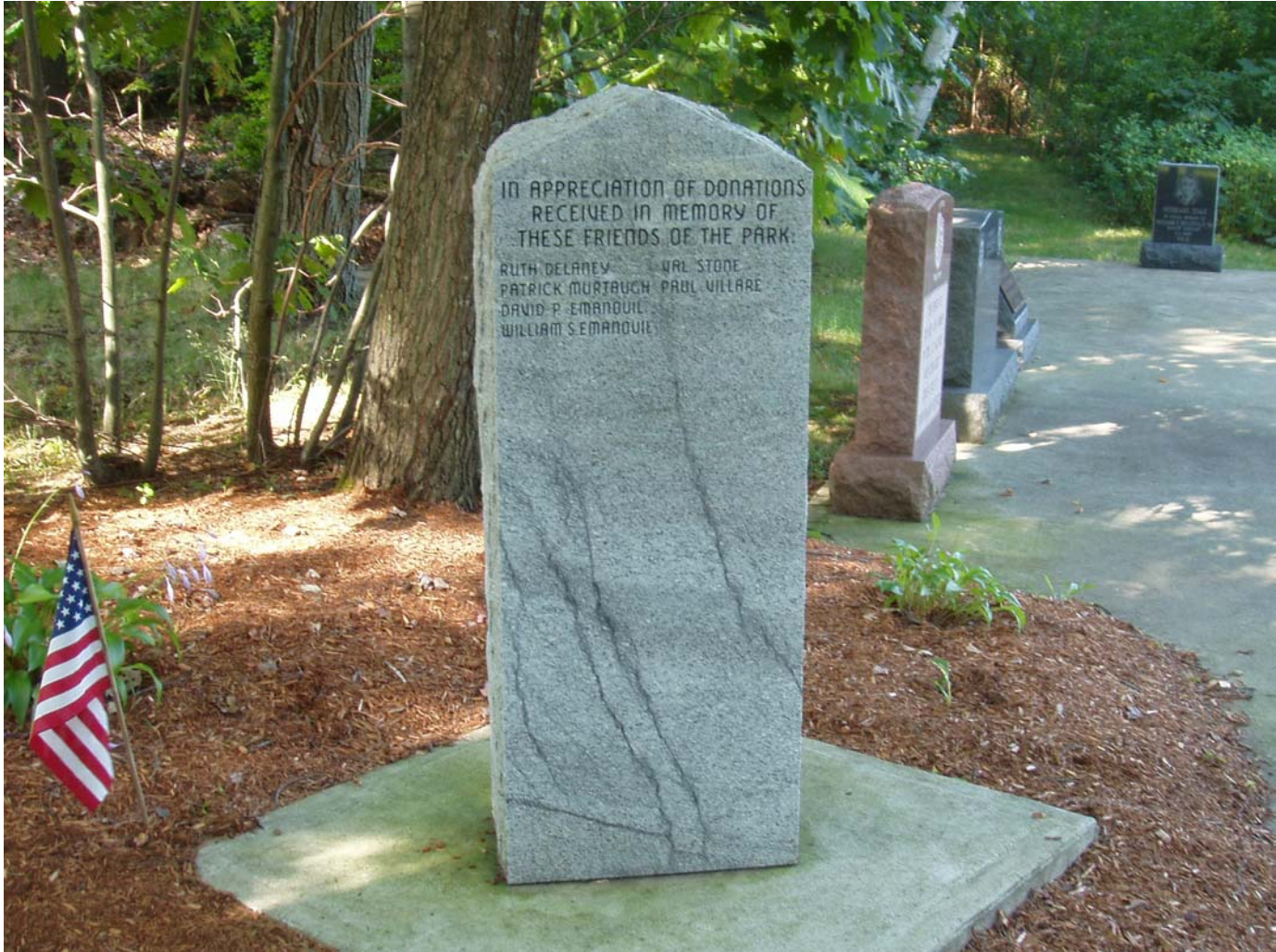
'Contributors' Stone' Veterans Memorial