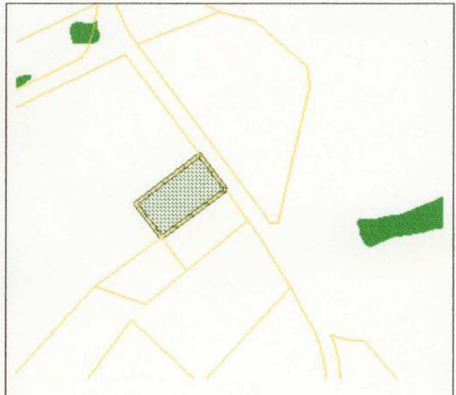
282 Mill Road from Assessor's records