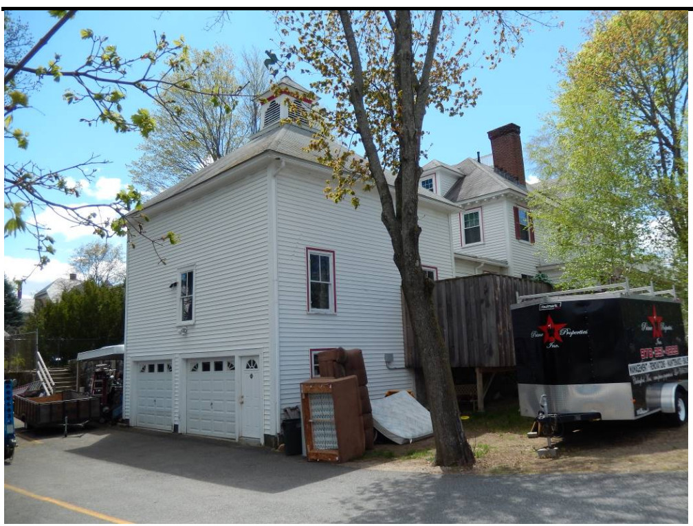
Converted carriage house, facing southeast. May 2016.