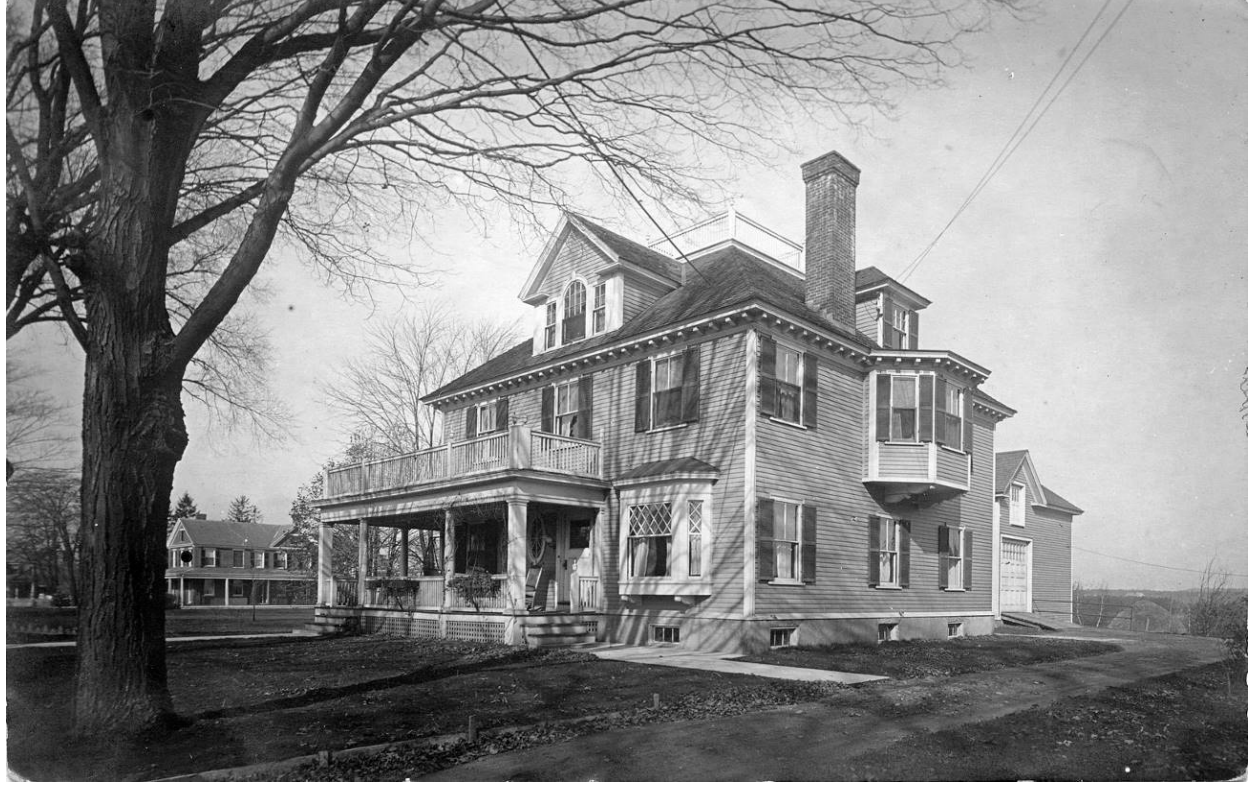
Undated photograph of 34 Middlesex Street.