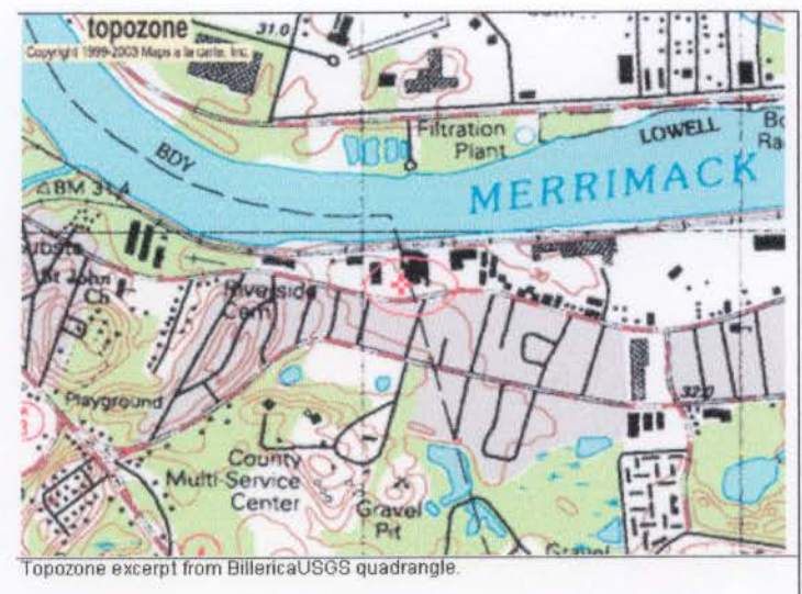
Decimal coordinates as provided by Topozone: 42°38'08" N 71°21'53" W