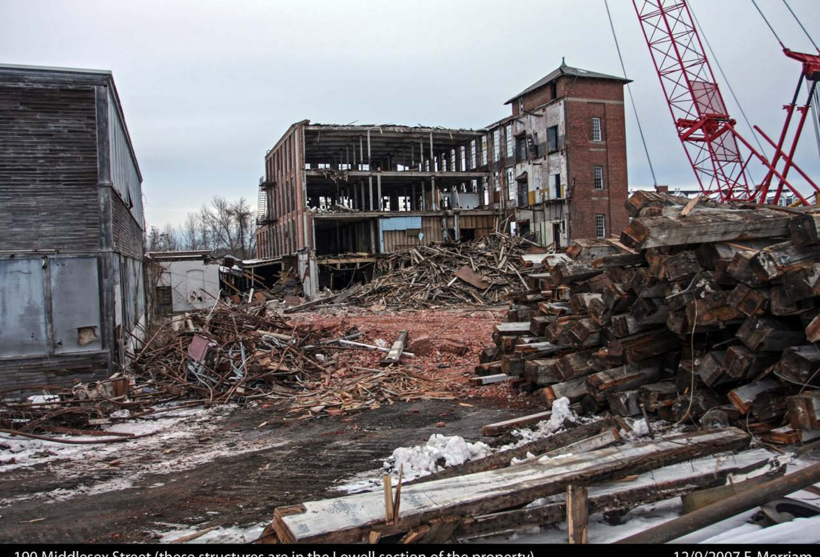
190 Middlesex Street (these structures are in the Lowell section of the property)