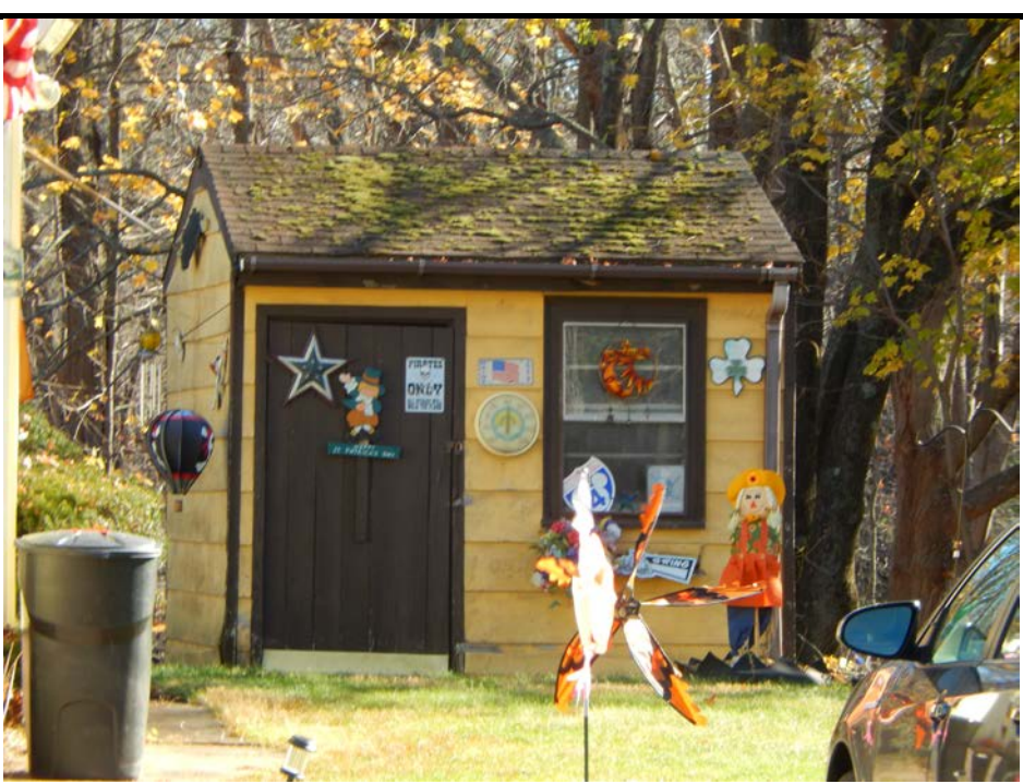
Garden shed at 182 Main Street, facing southeast. November 2015.