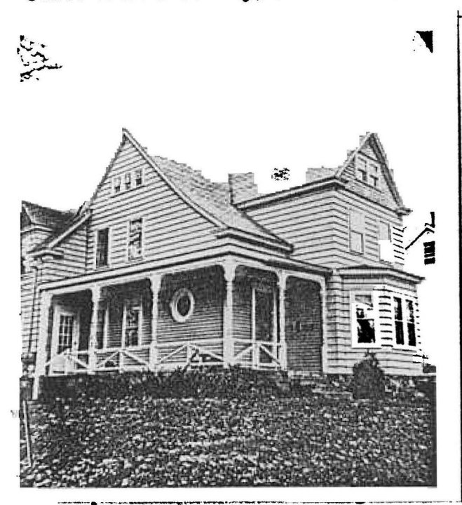
in relation to nearest cross streets and other buildings. Indicate north.

MASSACHUSETTS HISTORICAL COMMISSION Office of the Secretary, State House, Boston