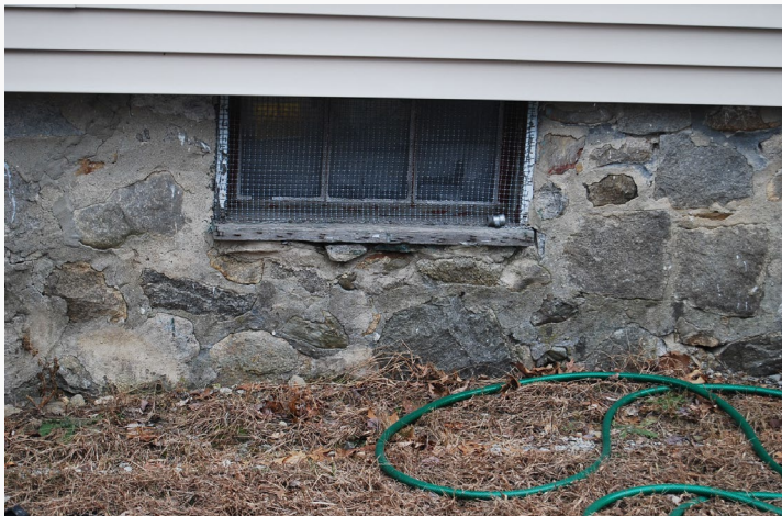
West and South elevations. View looking northeast. Foundation detail. West elevation.