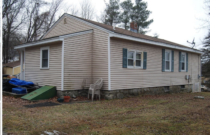
East and North elevations. View looking southwest. South and East elevations. View looking northwest.