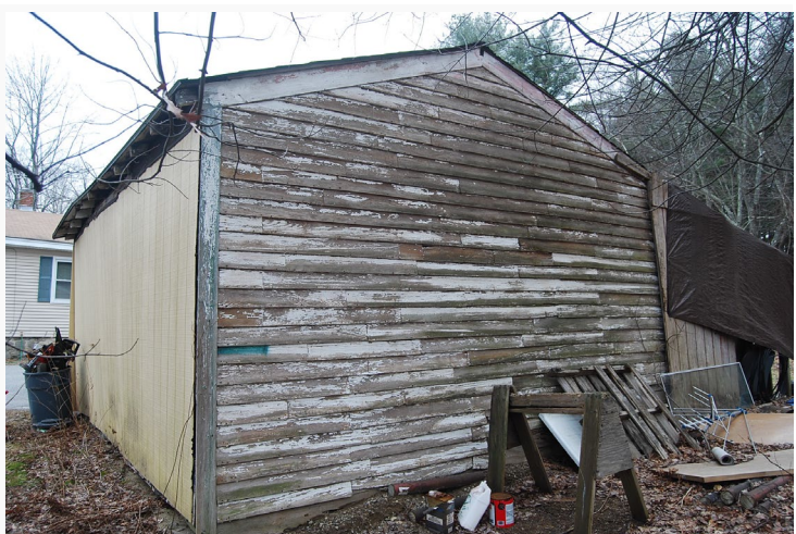
Garage. West elevation.