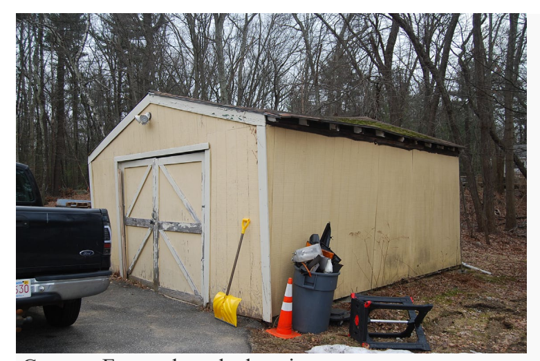
Garage. East and north elevations.