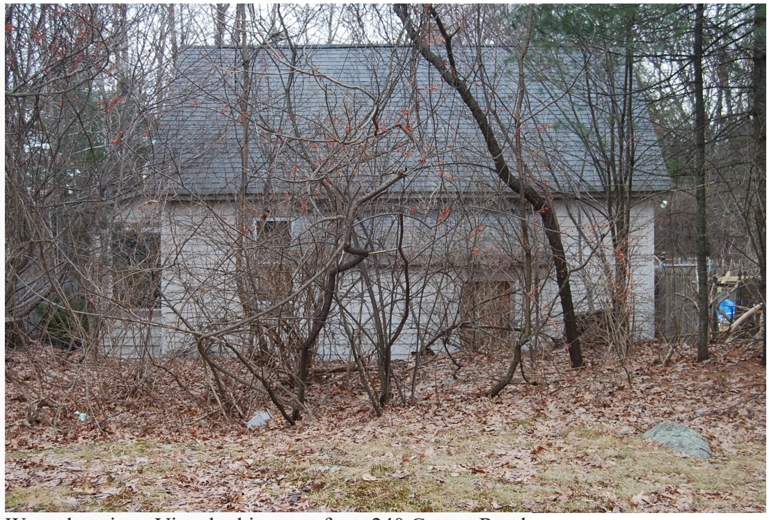
West elevation. View looking east from 240 Groton Road.