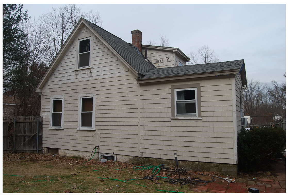
Rear, south elevation. View looking northwest.