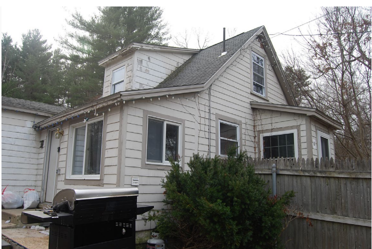
E and N elevations, view looking SW.