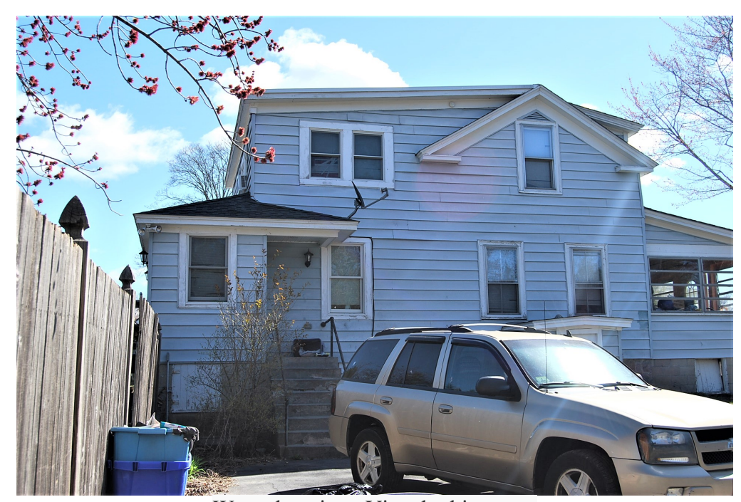
West elevation. View looking east.