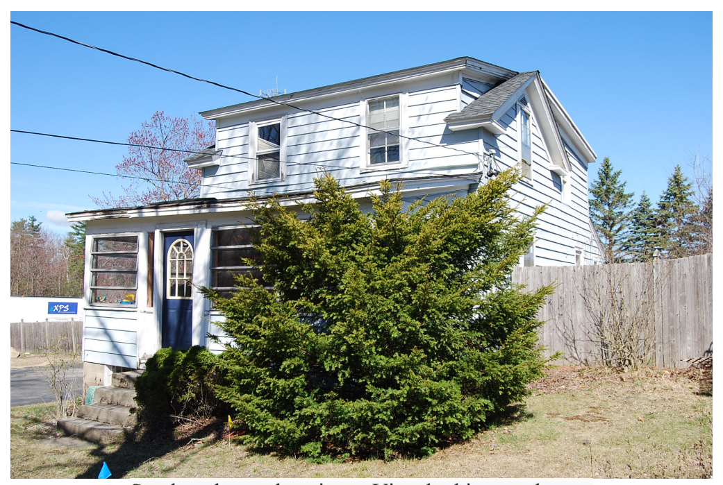
South and east elevations. View looking northwest.