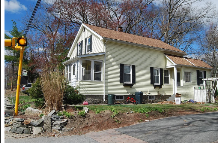
Façade and east elevation. View looking northwest.