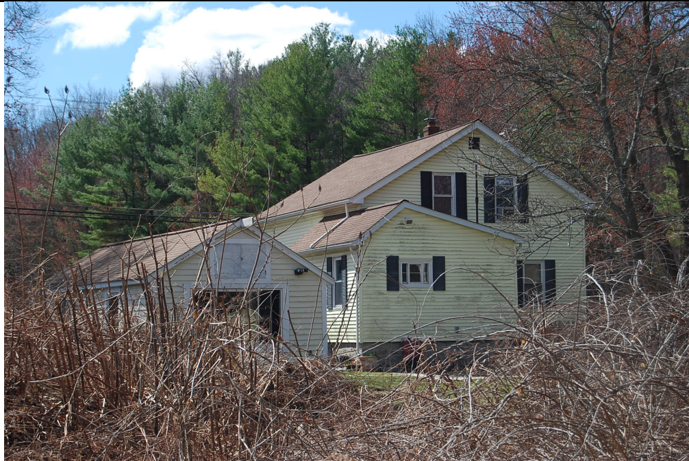
Rear (north) elevation. View looking south. Garage at left.