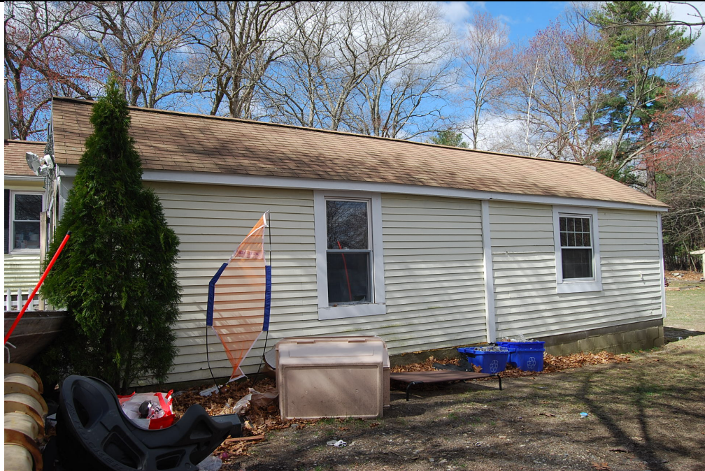
Garage. East elevation.