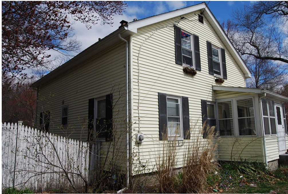
West elevation (left) and south façade (right). View looking north.