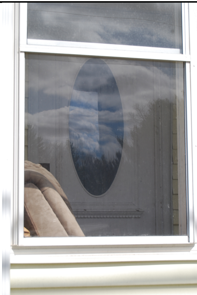
Façade entrance, now inside enclosed porch.