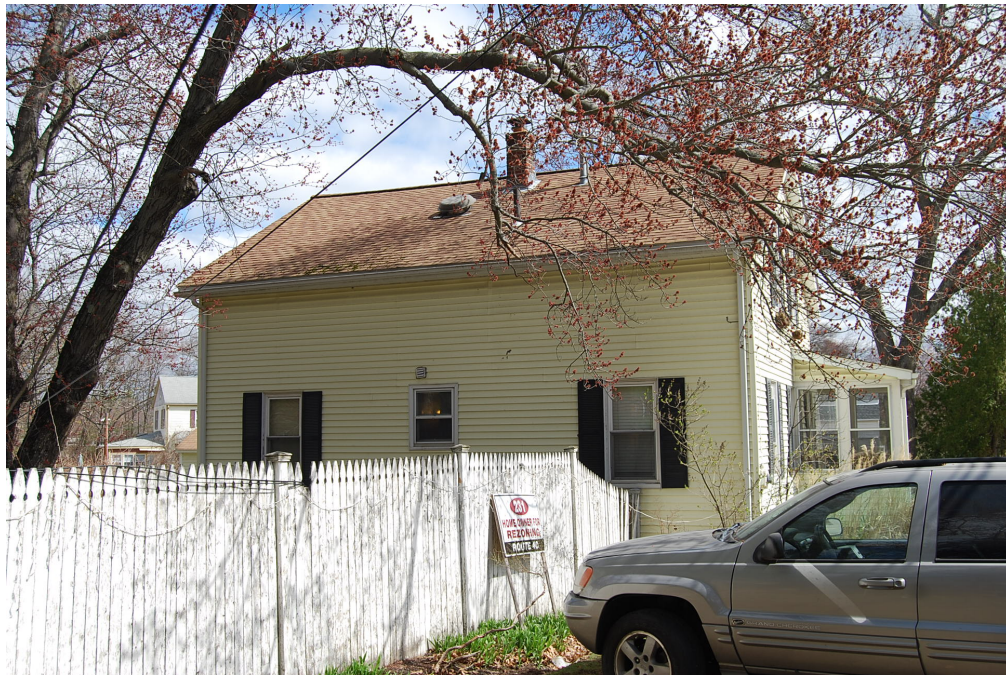
West elevation. View looking east.