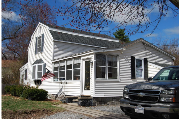
South Façade. View looking northwest.