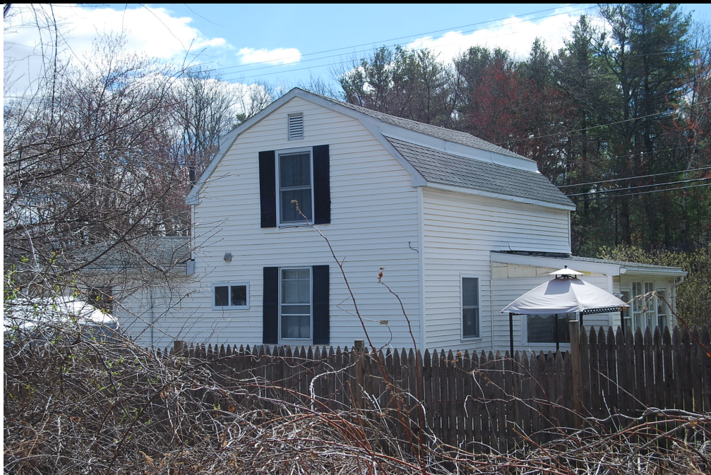
Rear elevation. View looking southeast.