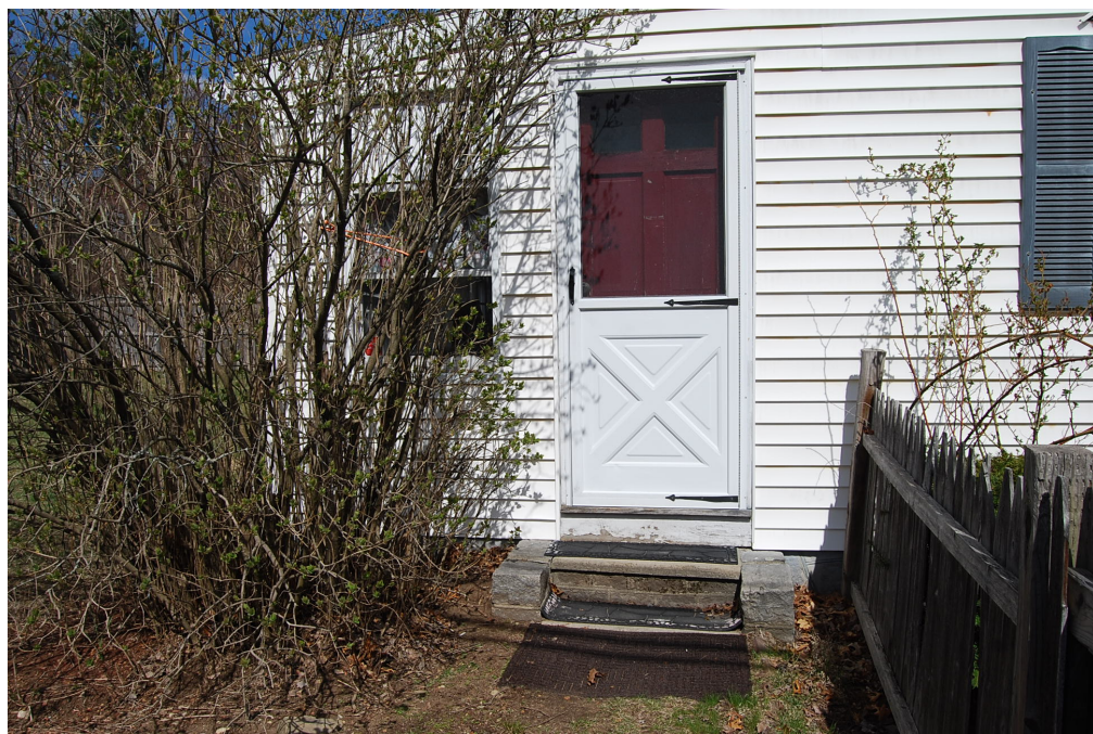
Secondary entrance in west enclosed porch. View looking north.