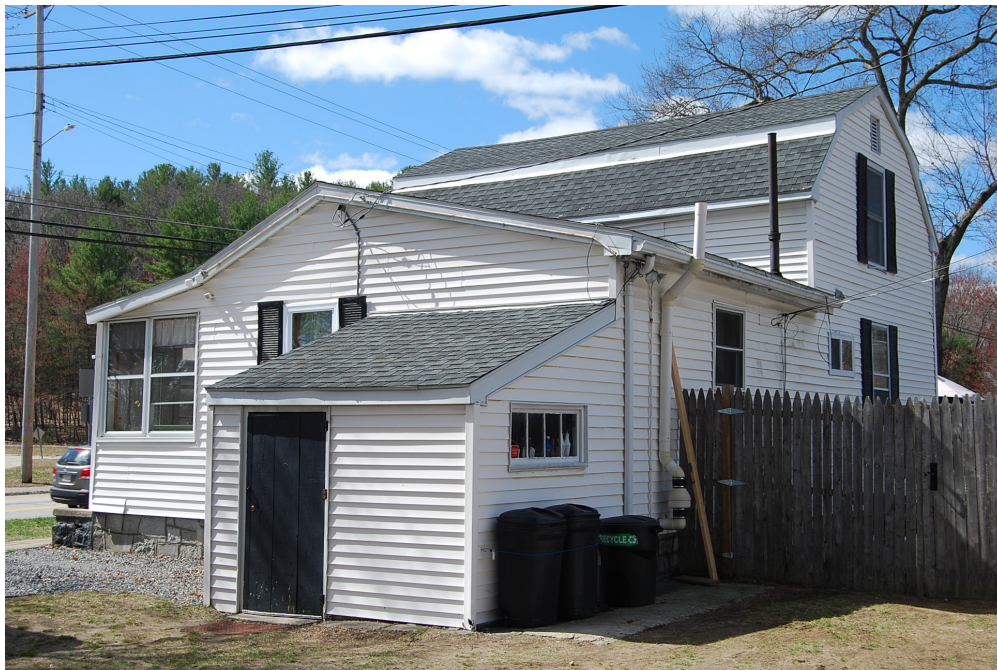
View looking west. Attached shed in foreground.