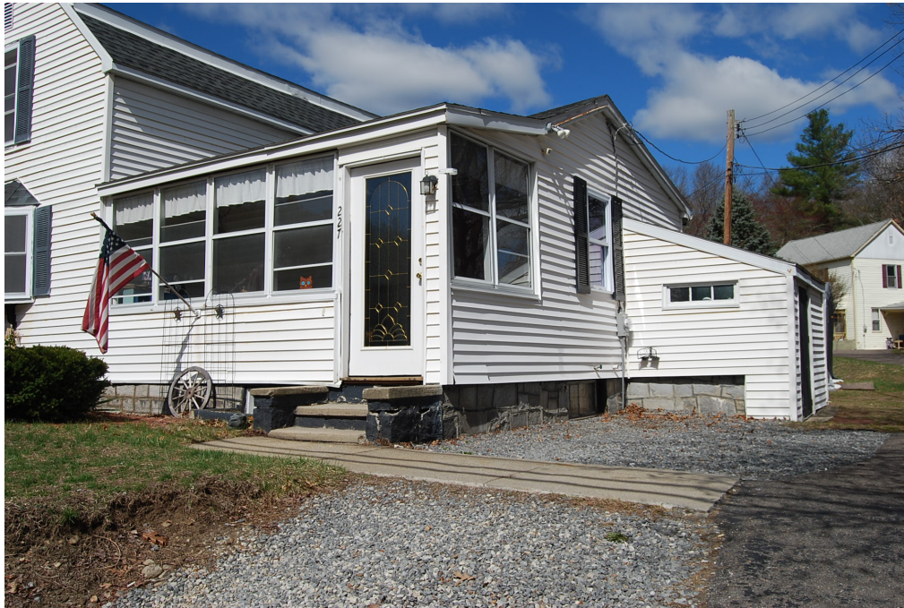
Enclosed porch at southeast corner, shed at right. View looking northwest.