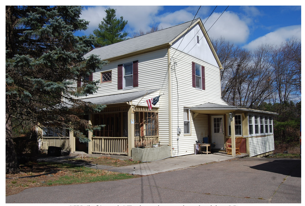
SW (left) and SE elevations, view looking N.