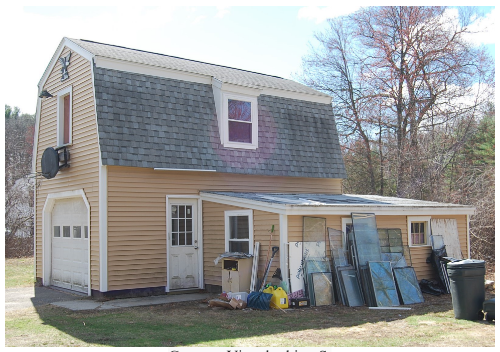
Garage. View looking S.