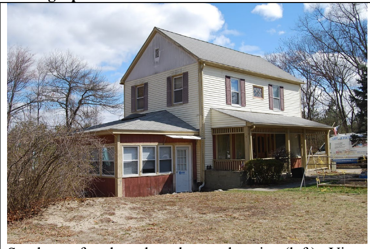
Southwest façade and northwest elevation (left). View looking northeast.