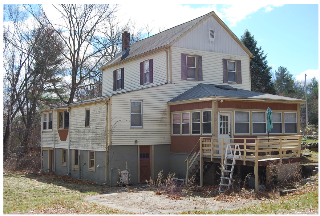
NW (right) and NE (left) elevations, view looking S.