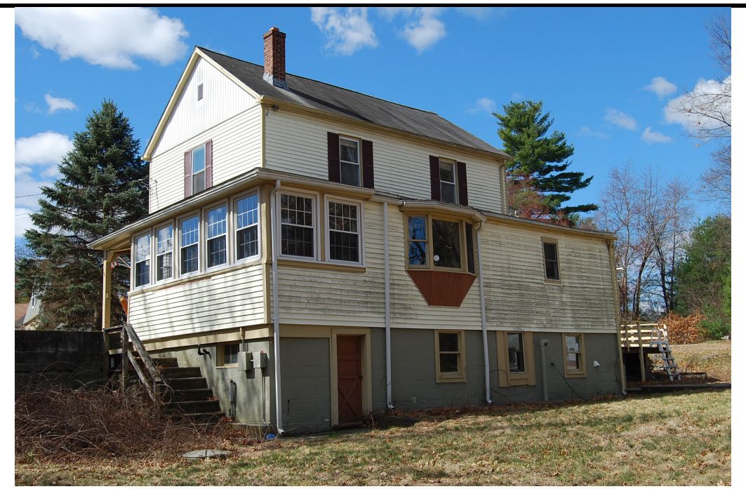
NE (right) and SE (left) elevations, view looking SW.