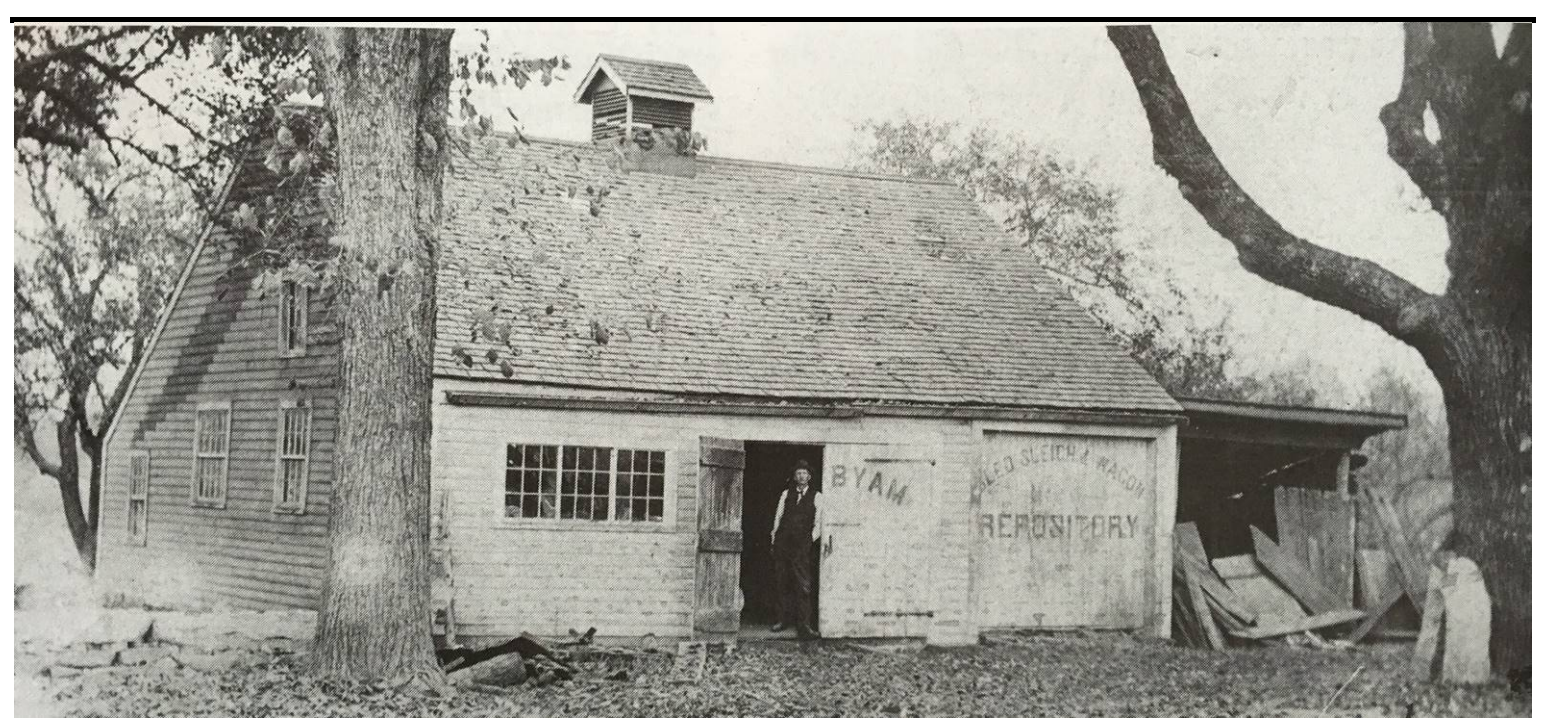
1908 photograph of the blacksmith shop in its original location on Maple Road.