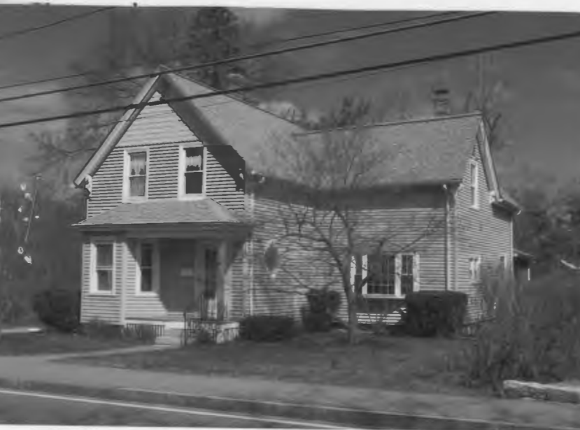
MA_Chelmsford_89_DunstableRoad_IMG_9189_CHC_2021 Locus Map

MASSACHUSETTS HISTORICAL COMMISSION MASSACHUSETTS ARCHIVES BUILDING 220 MORRISSEY BOULEVARD BOSTON, MASSACHUSETTS 02125