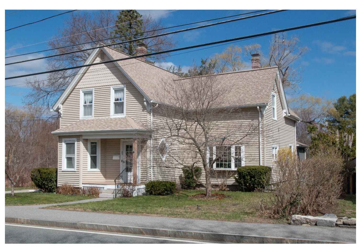
89 Dunstable Road, 2 April 2021