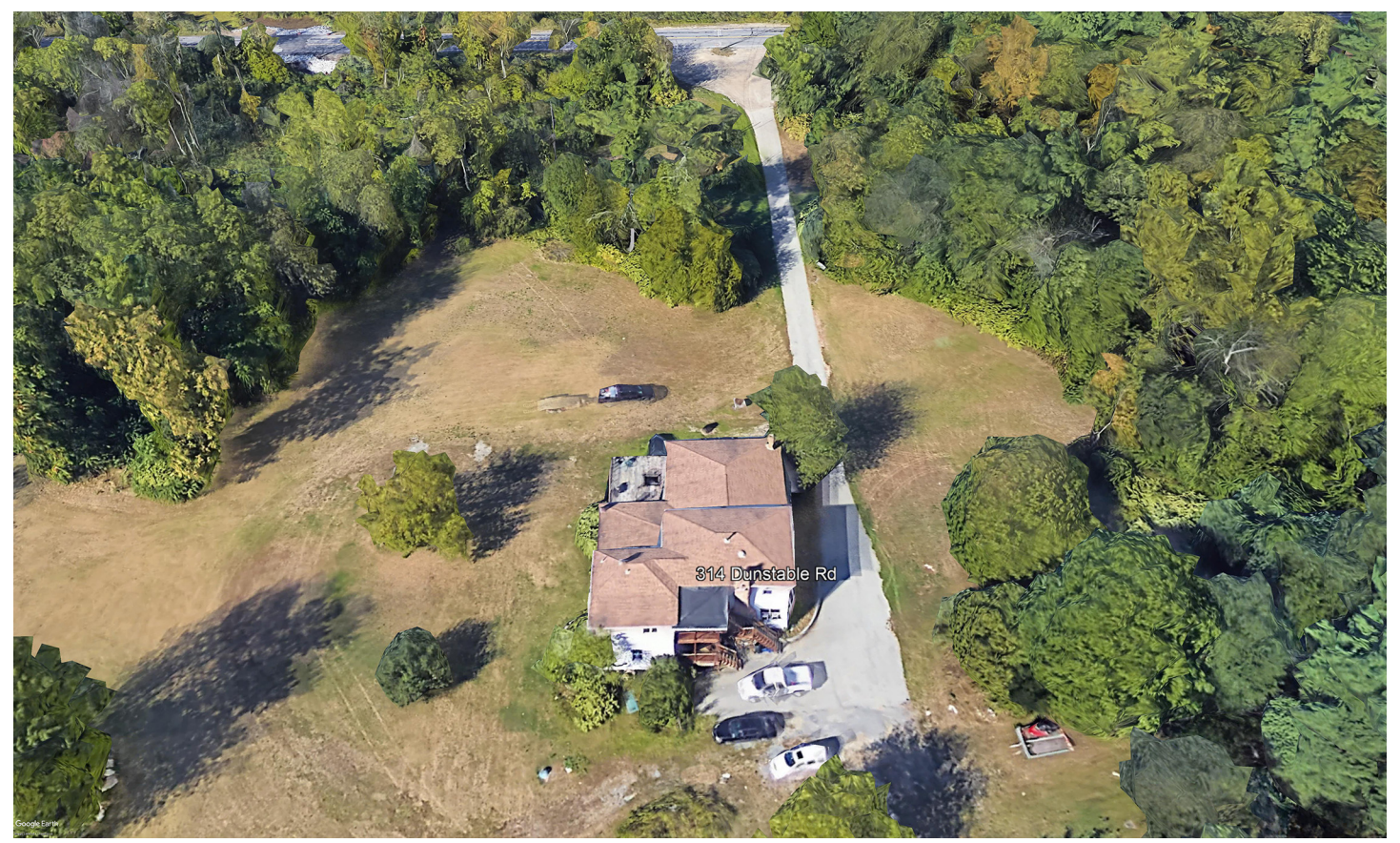
From Google Earth, 2021, before demolition