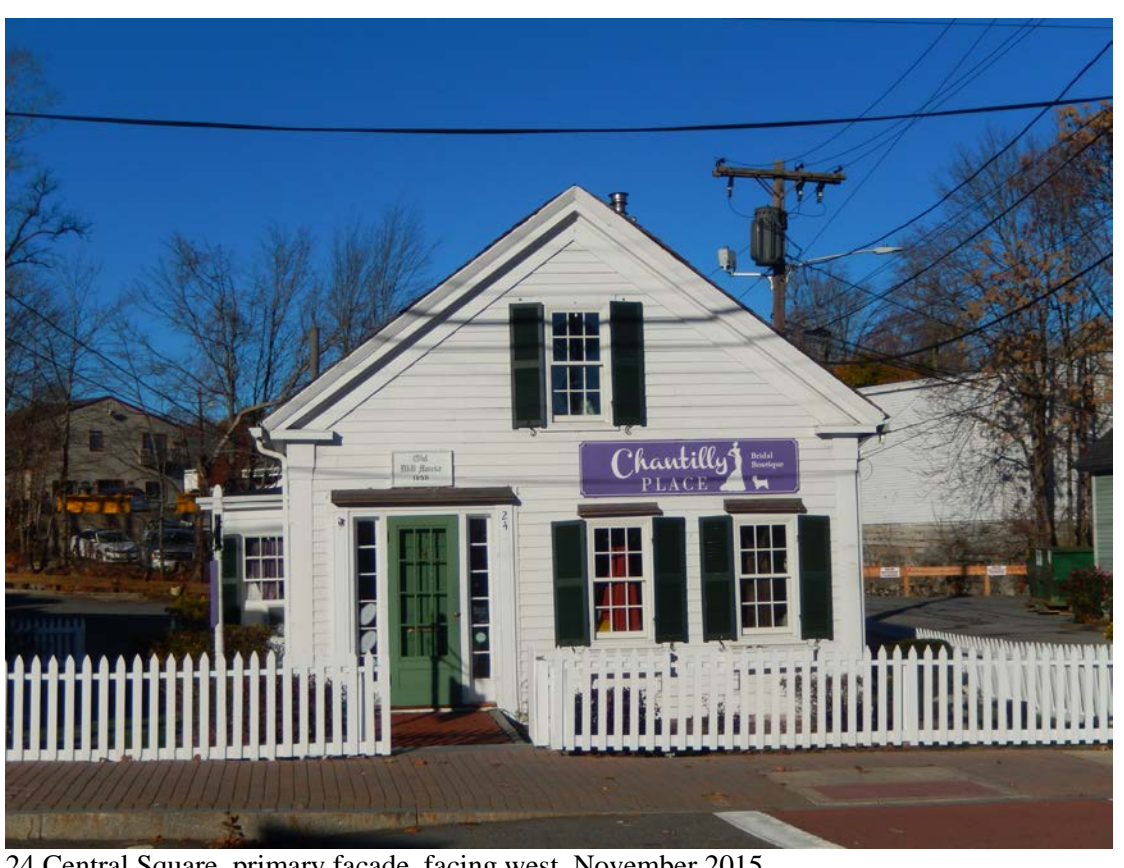
24 Central Square, primary façade, facing west. November 2015.