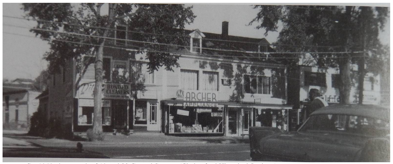
Ca. 1959 photograph of 19 and 22 Central Square.