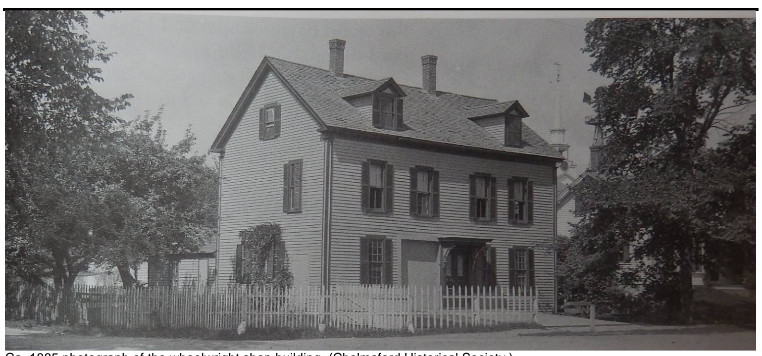
Ca. 1885 photograph of the wheelwright shop building.