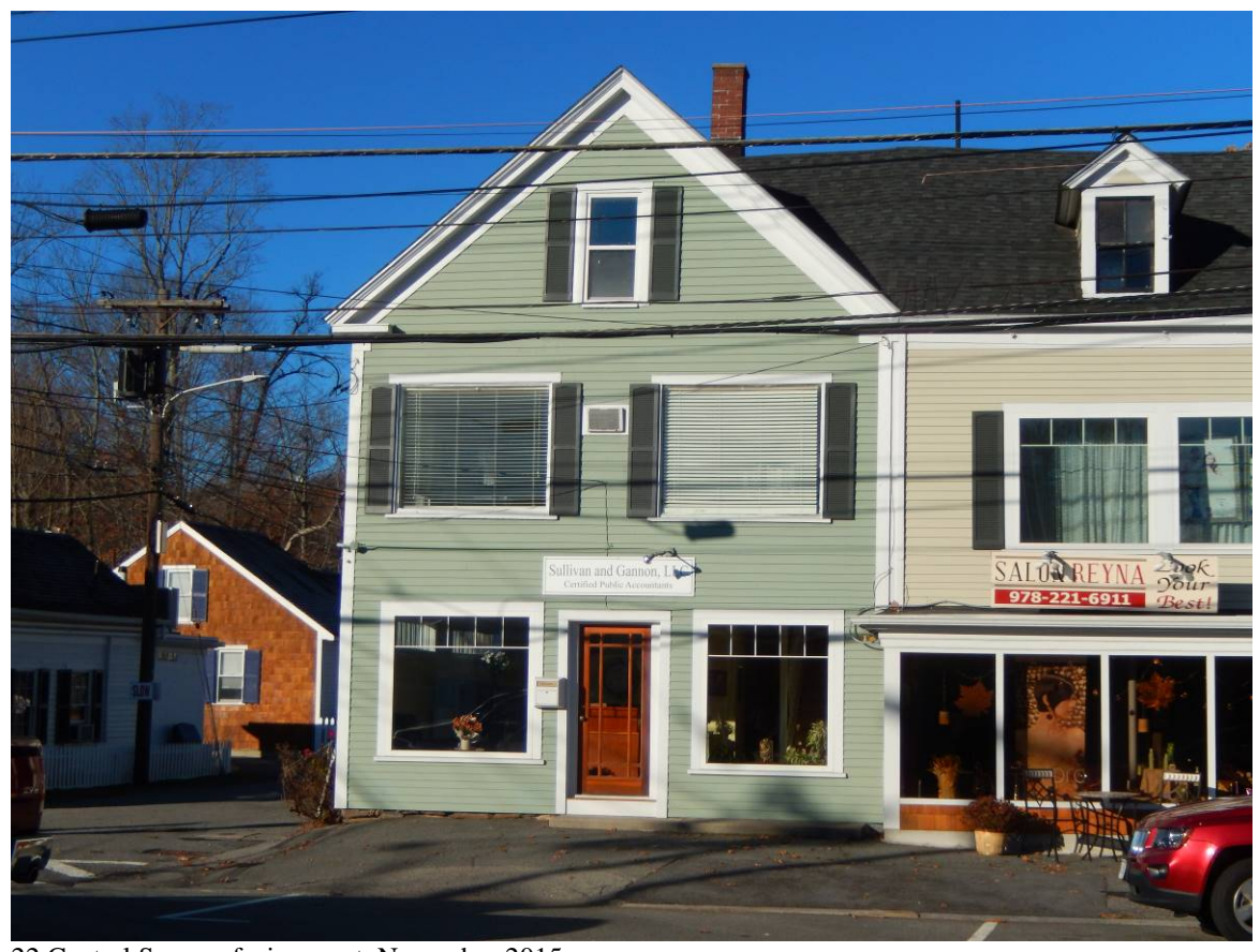
22 Central Square, facing west. November 2015.