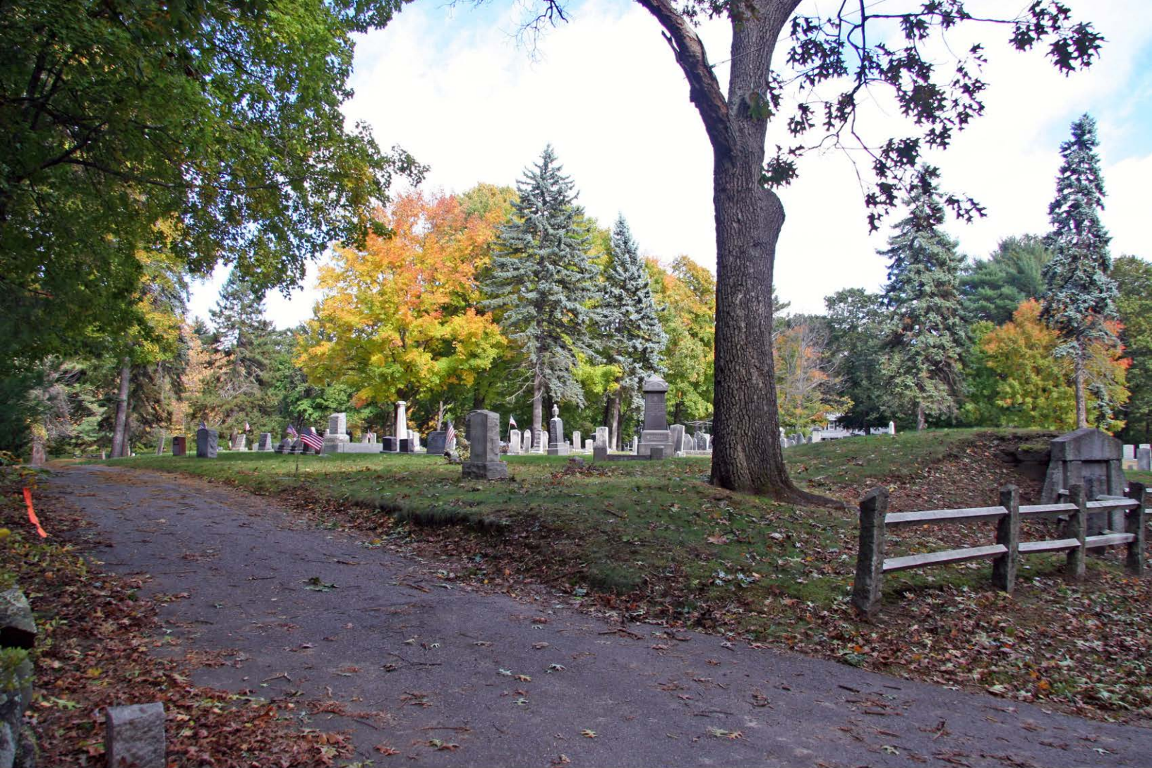
Heart Pond Cemetery