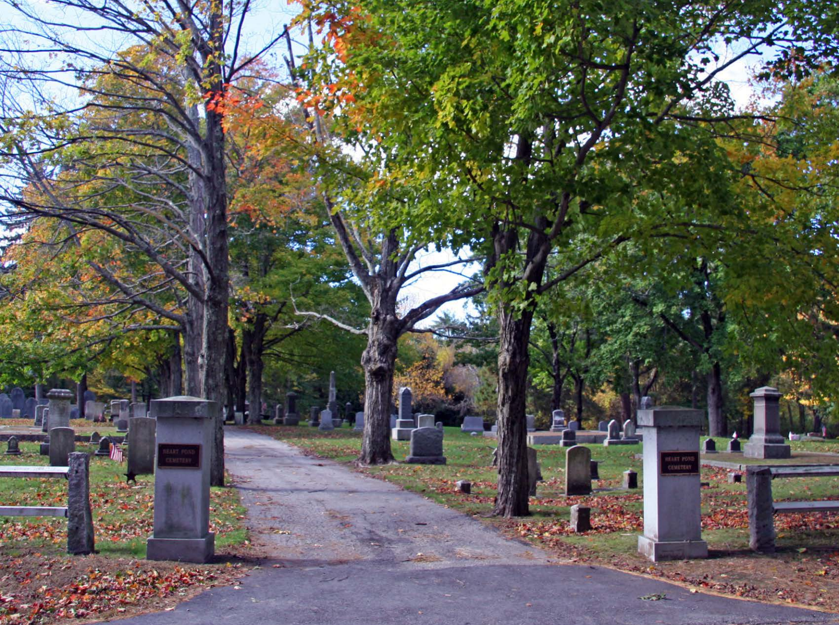
Heart Pond Cemetery