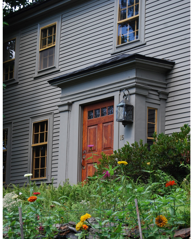
Entrance detail. View looking northwest.