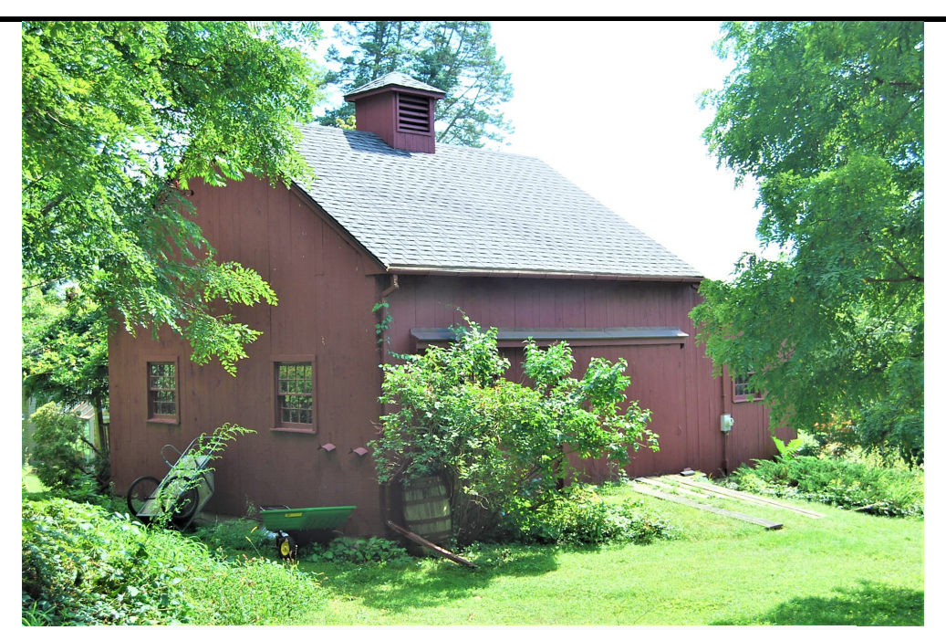
Barn/Garage, north and west elevations. View looking southeast.