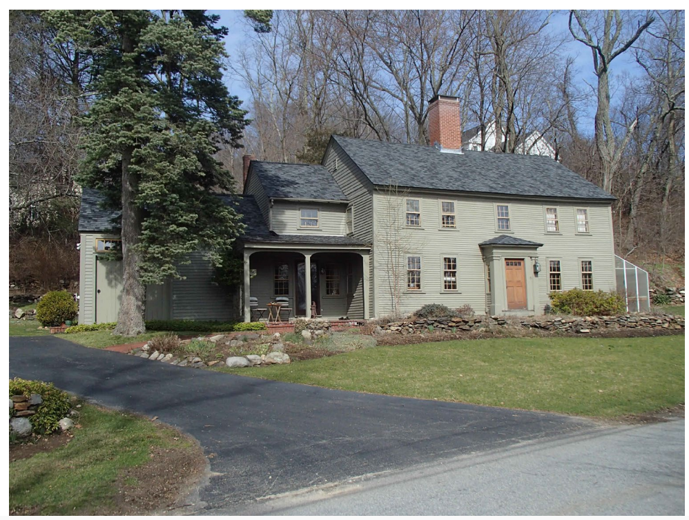
Photograph in Chelmsford Assessor's database, providing a clearer view of ell.