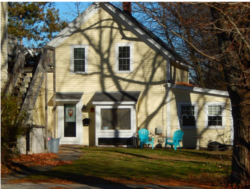
Carriage house, facing east. November 2015.

Walling, Henry. Map of Middlesex County, Massachusetts . Boston: Smith & Bumstead 1856. Available from the Chelmsford Historical Commission map collection.