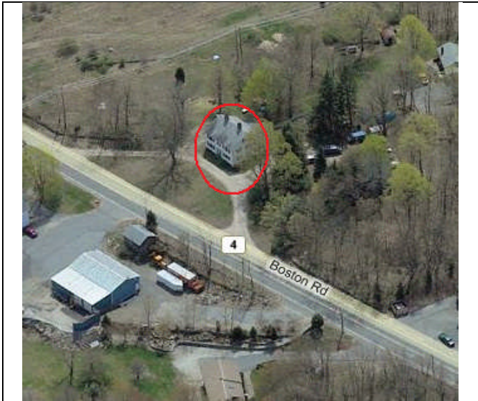
1187-9 Boston Road www.local.live.com