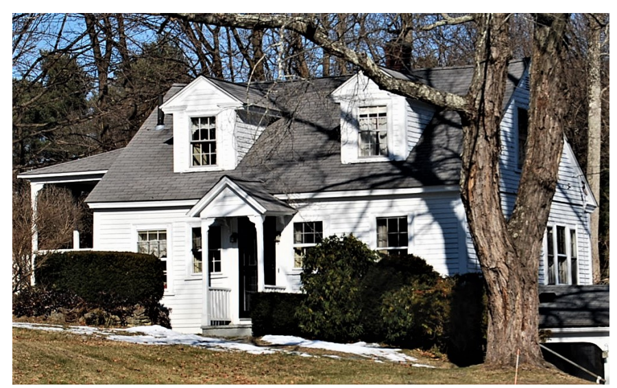
View looking northeast.

220 Morrissey Boulevard, Boston, Massachusetts 02125