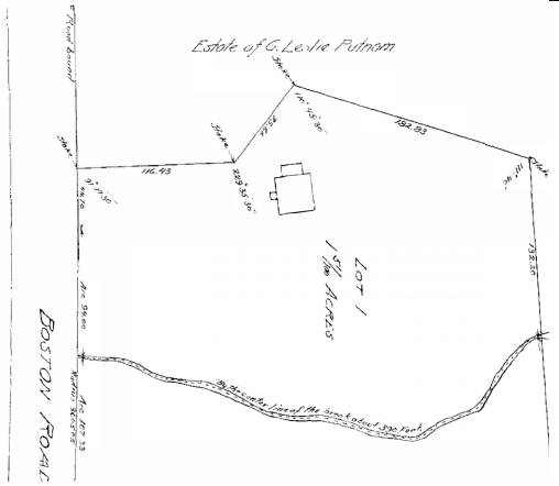
The property in 1943. Middlesex North Registry of Deeds Plan Book 65, Plan 97.