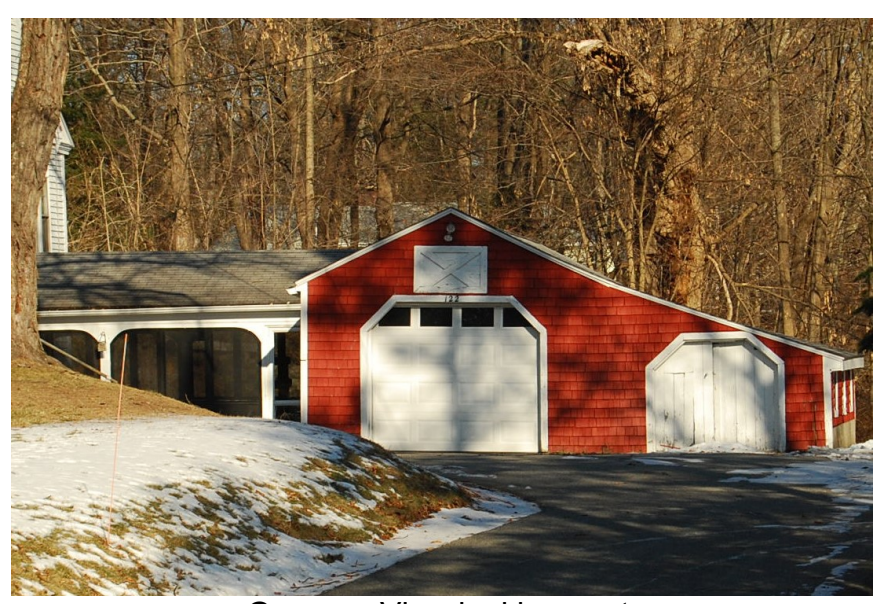
Garage. View looking east.