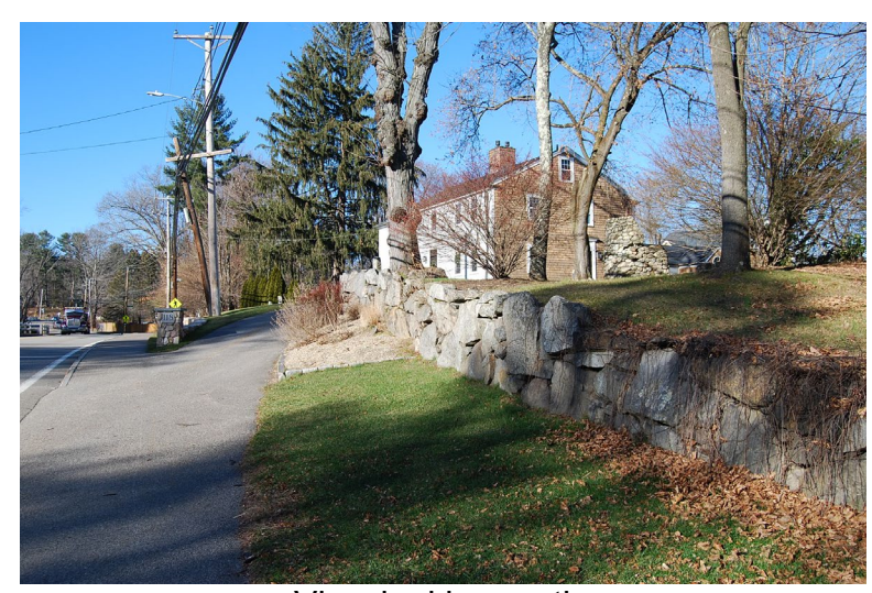
View looking north.