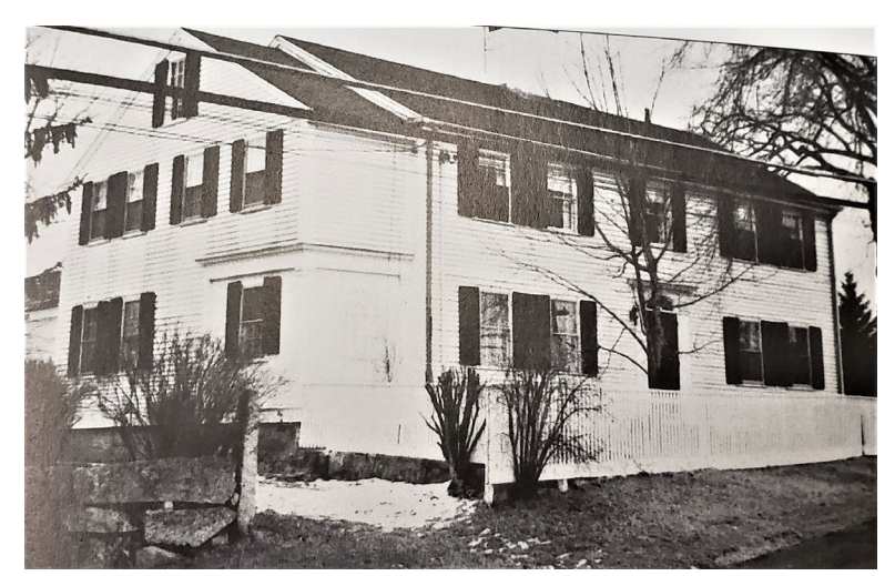
Historic image. View looking southeast.