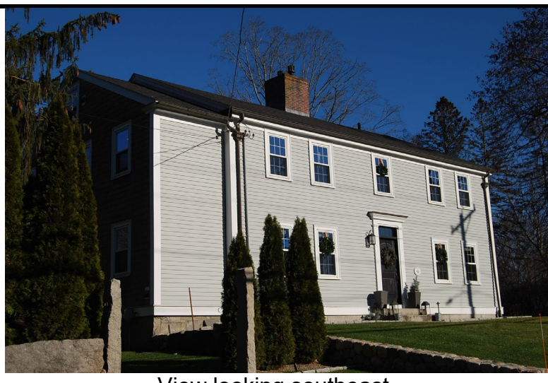
View looking southeast.