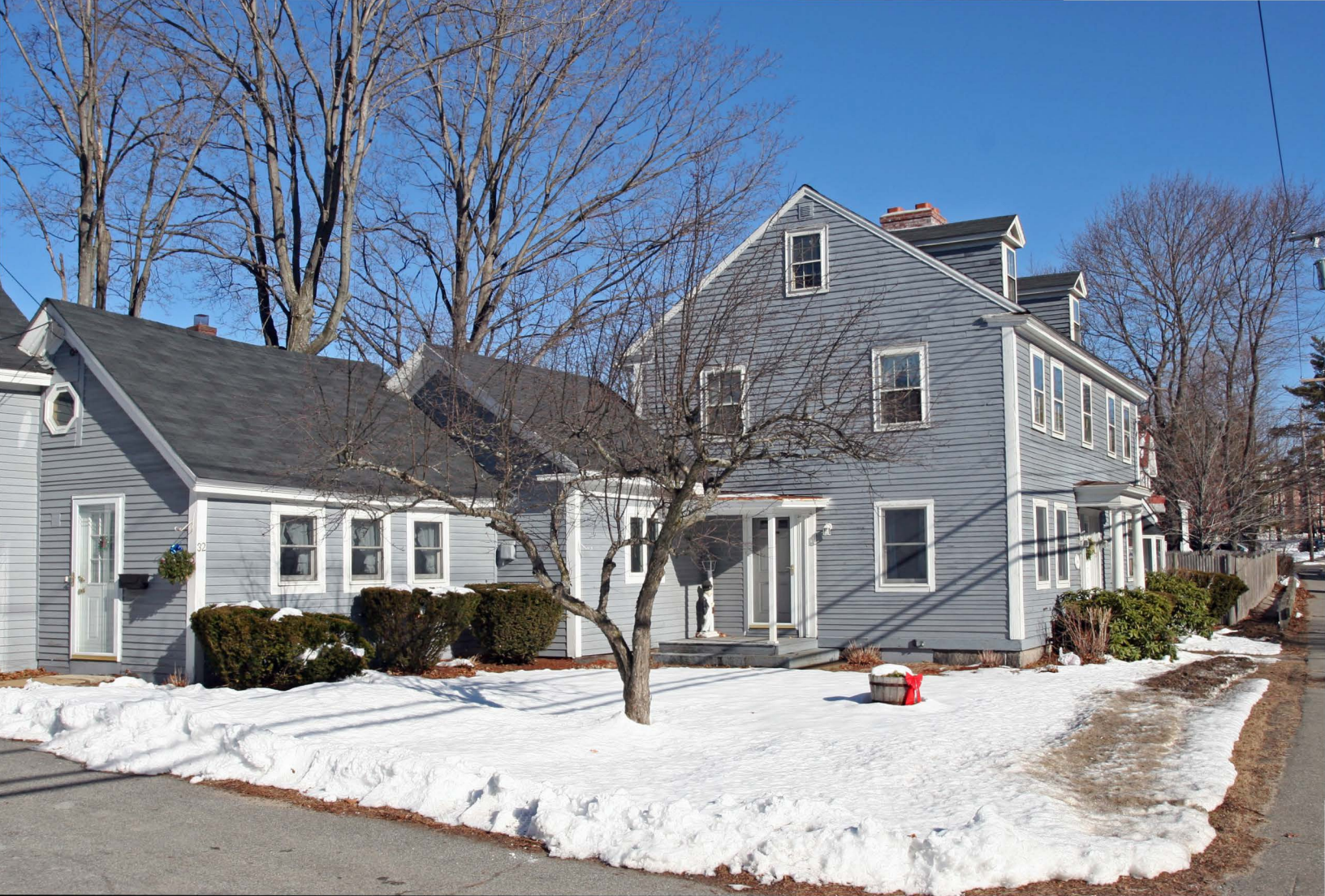
32 Billerica Road