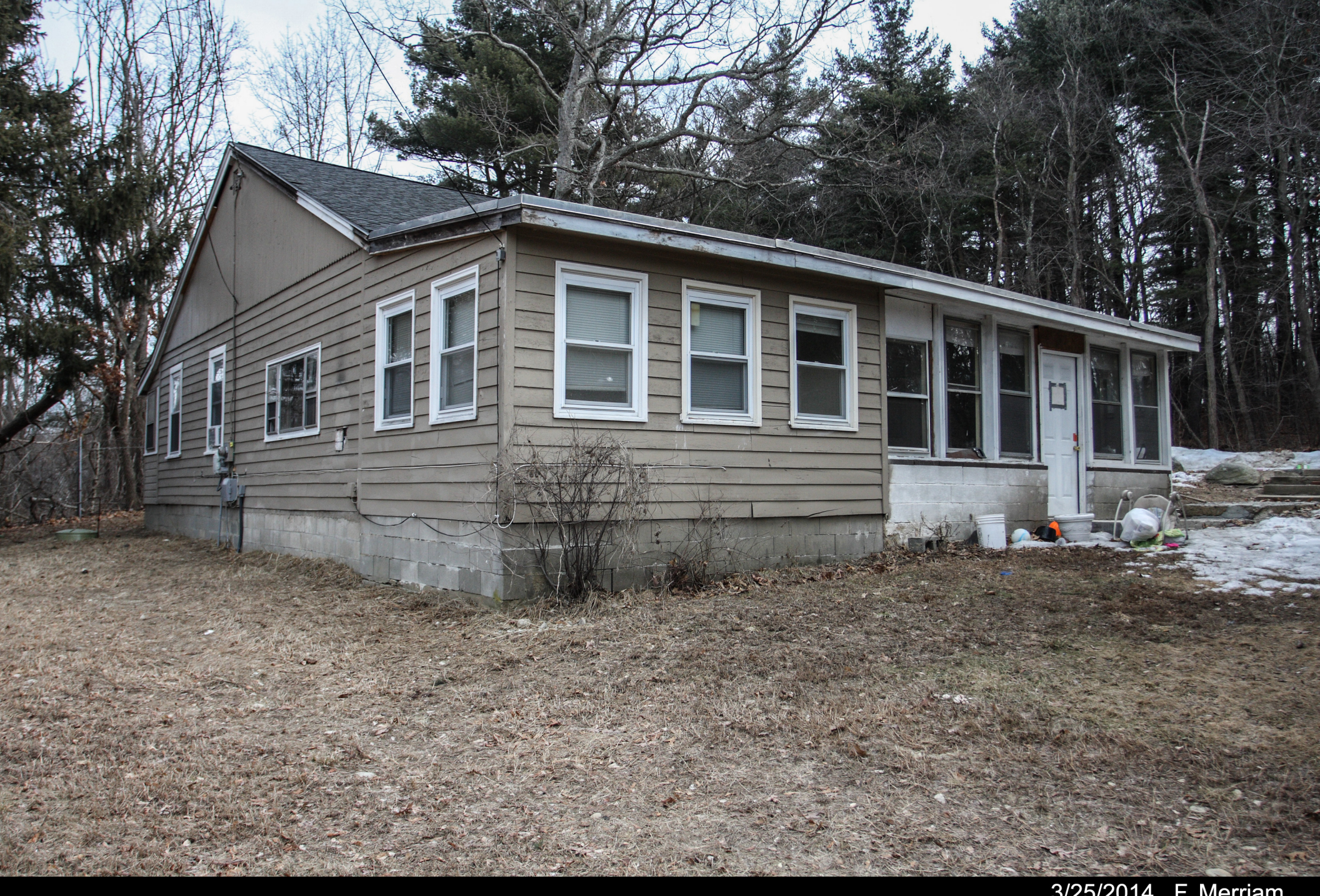
3/25/2014 F. Merriam