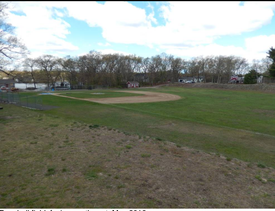
Baseball field, facing southwest. May 2016.