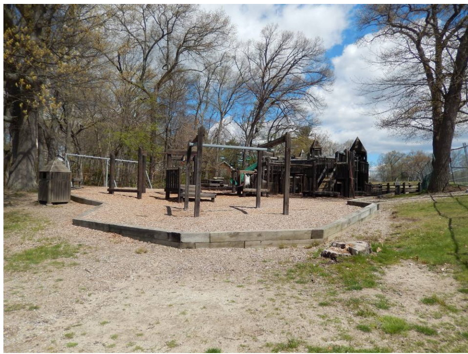
Playground equipment, facing northeast. May 2016.