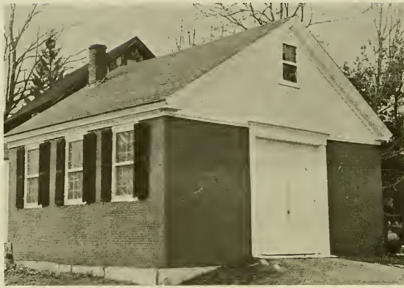
1802 School House