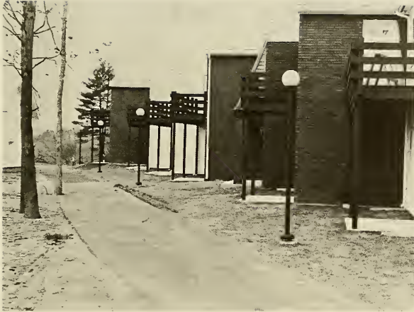
Housing for Elderly

Applications for this housing were made available at the end of August and during the first two weeks 90 applications were returned, indicating the enthusiasm and need for this type of housing in the community. During the year 127 applications were received. These were numbered as they were received, each applicant scheduled for a personal interview to determine eligibility under the existing regulations, then each applicant was notified of his standing in the tenant selection process, taken in the order their application was received. The first 64 eligible applicants were assigned units, the next 30 eligible applicants have been assigned in order on the waiting list, and 33 were declared to be ineligible for various reasons, usually because they were not yet 65 years of age or were over the allowable income. Because of the large number of applicants having to be assigned to a waiting list — close to 50% of the number of units built — and the anticipated increasing need in the next few years as more people achieve the age of 65 in a time of great increase in the cost of living, the members of the authority are requesting approval of the townspeople at the Annual Town Meeting to proceed with the construction of additional elderly housing.